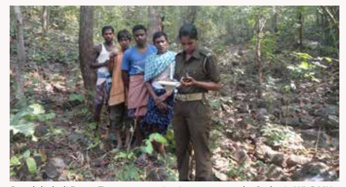
Dandabahali Forest Transact mapping in progress under Satkosia WL DMU

The remarkable achievement of the AJY programme is that the incidence of forest fire has become a thing of the past in the forests adjoining to above mentioned VSSs during the year 2017. This was possible for sustainable use of forest resources. The members of VSSs meet every month at executive meetings and make resolutions for protection of biodiversity and effective use of forest produces. This has become beneficial for AJY programme.