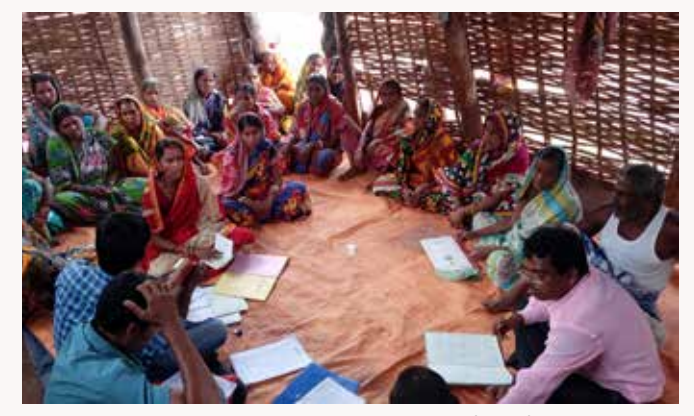
Community orientation meeting at Nuagaon VSS under Satkosia WL DMU

Thirty one Vana Suraksha Samitis (VSSs) have been formed in the peripheral regions of Satkosia Wildlife Sanctuary by Satkosia wildlife division. These VSSs are included in the third phase of Ama Jangala Yojana (AJY). Nearly 1550 hectares of Reserve Forest (RF), Demarcated Protected Forest (DPF) and Revenue Forest (RF) located close to the above mentioned 31 villages and hamlets have been earmarked for VSSs for proper management and protection of forest resources. Pillar posting for demarcation of forest land boundaries have been done with the stakeholders of villages and hamlets after reaching consensus. Formation of Executive Committees, Micro plan committees and Convergence committees have been done after due ratification by Palli Sabhas in the respective villages and hamlets. All the 4895 members, both men and women had participated in the deliberation of 31 PalliSabhas conducted for this purpose. Of the total members attended the Palli Sabhas, SCs were 410, ST 1788 and women numbered 2372. It was heartening to note that the members who took part in the discussion in the PalliSabhas put forth their opinion confidently.