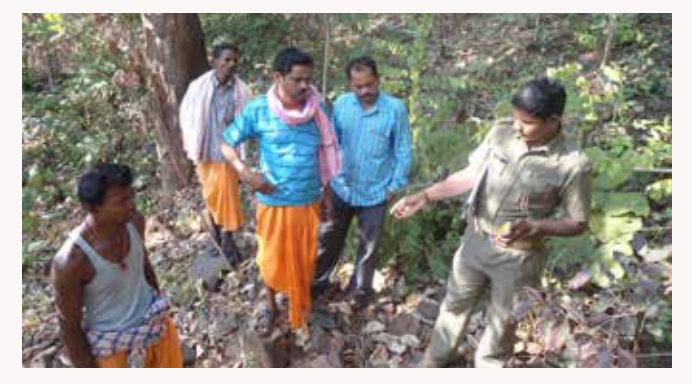
Forest Transact Mapping of Baragoatha Dalasahi under Satkosia WL DMU