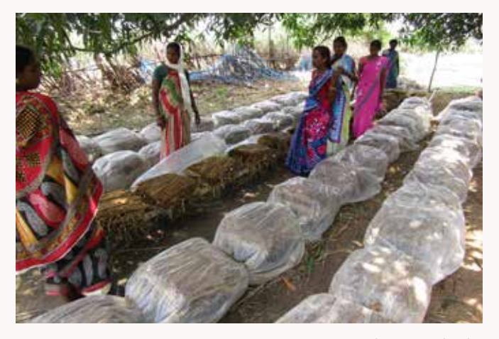
IGAs Promotion in SHGs in Bamara DMU in convergence with ITDA, Kuchinda

A detailed proposal was prepared to initiate and execute this IGA covering all the aspects of operational process at a cost of Rs. 2.5 Lakh rupees and this was taken up by ITDA, Kuchinda as per the proposal of Sub-Collector, Kuchinda. As per the convergence plan approved by the District Administration, ITDA supported 50% of the financial assistance required under the project, the training requirements decided to be supported by AJY. The rest of the expenditure was to be borne by the VSSs and the SHG groups in the form of labour component and materials available at their disposal. SHG members were entrusted marketing of the product.