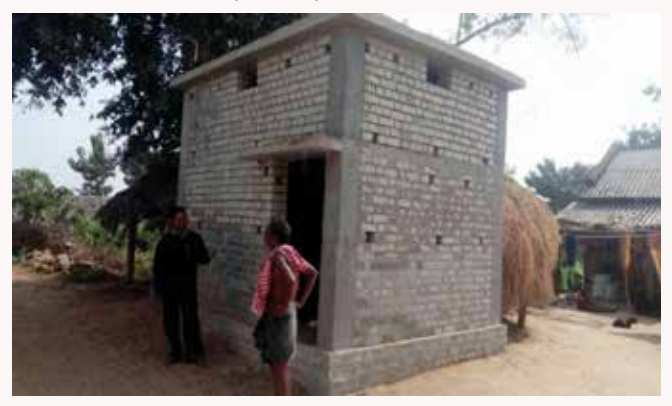
Construction of Maa Mangala Pitha in convergence with MLA LAD Fund

This proved by the VSS that the convergence of programmes and resources can be an effective way of creating mile stones in the development process.