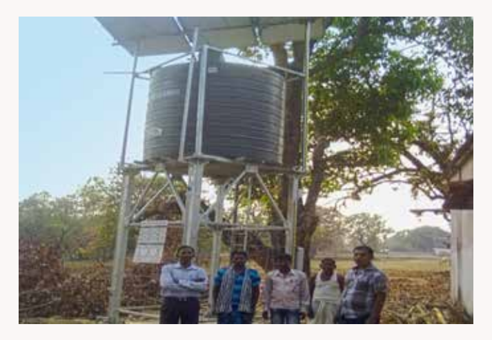
Solar Energy Based Drinking Water Supply at Arjunchuan VSS

Safe drinking water is one of the basic needs of life. But, it was lacking in Arjunchuan VSS under Banki FMU of Rourkela DMU. There are 115 numbers of of Household in the village with a total population of 600. During Microplan Preparation & PRA process under AJY, the P-NGO Team identified safe water scarcity as one of the basic problem and tried to solve the problem of villagers. After the approval of GB of the VSS,