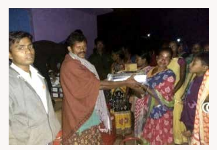
Convergence with PM Ujjwala Yojana in Koraput Division

The inhabitants of village Patamaliguda in Podagada G.P of Dasmantpur Block were using firewood as their fuel to cook. After the initiatives under AJY scheme, Partner NGO-I.A.E.E.T., Koraput and Forest Department intervened and motivated the villagers to refrain themselves from destroying the forest and offered the option of cooking gas. The villagers appreciated the initiative and accepted to enroll themselves under Ujjwala scheme to get gas connection in their houses. Ten households got gas connection from Indane Gas under the Scheme after depositing Rs. 1683/- per family. Patamaliguda VSS took a leading role in executing this scheme to reduce pressure on forest woods and motivating the 75 families to adopt the gas cooking method.