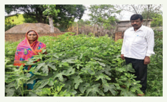
Kitchen Garden developed by vegetable minikit support at Mishrapali VSS area of Rourkela Division, an AJY convergence initiative

have been undertaken in convergence with the schemes and programs of various Departments. Some of the activities carried out through schematic convergences in various Divisions are given in a snapshot.