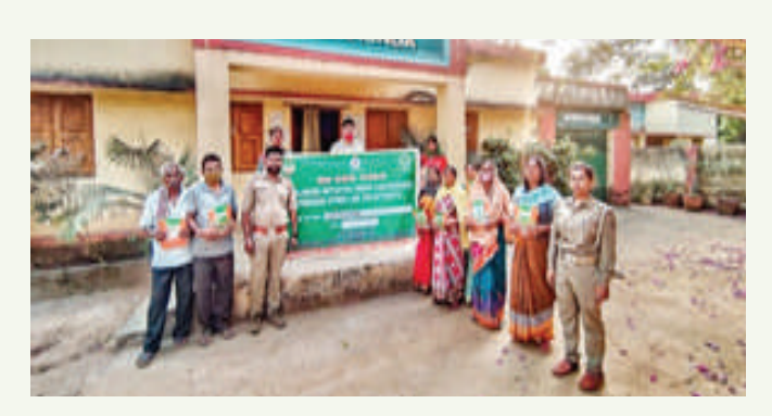
Vegetable seed minikit distribution at Raourkela Division through convergence with Horticulture Dept.