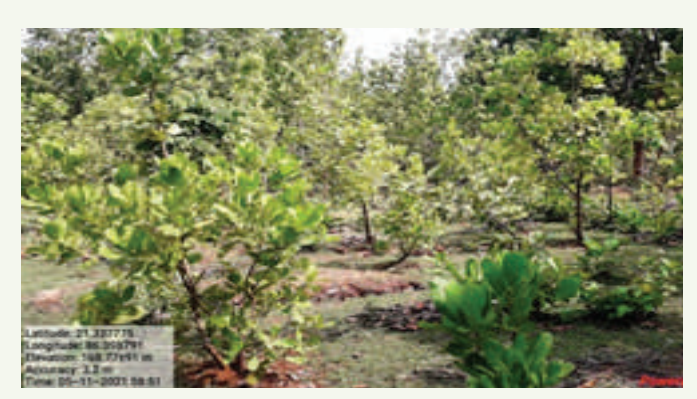
AR_Plantation site at Khajuribani VSS, Keonjhar Wildlife Division