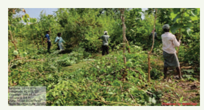
SSO work at Bagpada VSS, Khariar Division