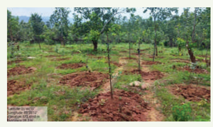
Maintenance work of ANR with Gap Plantation at Sundra VSS of BJP Range, Keonjhar Division