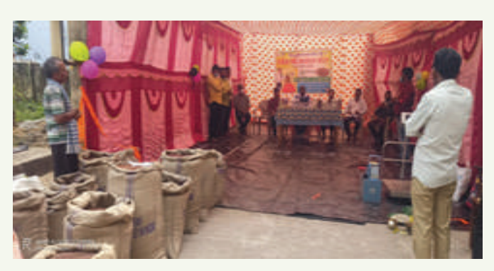
The Millet Mandi established at Gandharabhuin Village

The impact of the trainings and mobilization was clearly visible from the crop production. Improved cultivation practices and better soil management practices