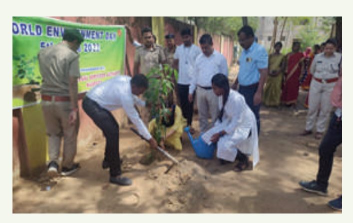
World Environment Day celebration at Khariar Division