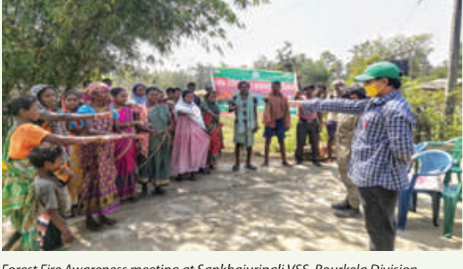
Forest Fire Awareness meeting at Sankhajurinali VSS, Rourkela Division