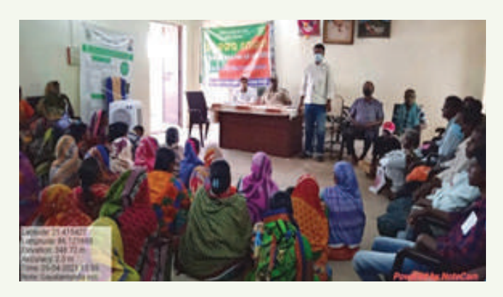
Capacity Building Training Program at Gayalamunda VSS, Keonjhar Wildlife Division

collaboration with Line Departments. The CBTs conducted during the period are - capacity building of VSS members on livelihood promotion, VSS management and enhancement of employable skills. The following picture depicts some of the major initiatives.