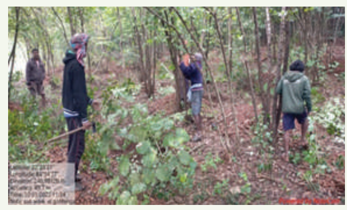
Silvicultural Operation at Gutitangara VSS under Rourkela Division