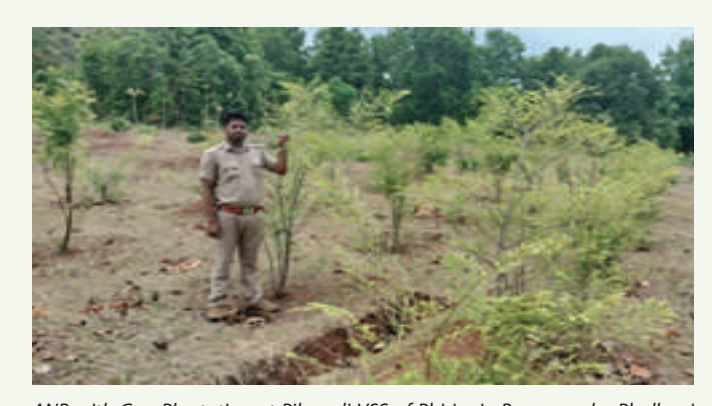
ANR with Gap Plantation at Pikaradi VSS of Phiringia Range under Phulbani Division