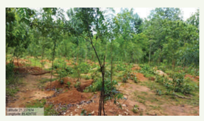
ANR with gap plantation at Gopinathpur VSS of Telkoi Range, Keonjhar Division

22 Forest Divisions. Similarly, 3rd year maintenance in 27,000 Ha and 4th year maintenance in 25,950 Ha of ANR-without gap plantation was carried out in 22 Forest Divisions. As a low-cost restoration method, ANR interventions have proved to be effective methods to restore degraded vegetation. This involves thinning, high stump cuttings, climber cutting and cleaning initiatives for which summer months are best suited.