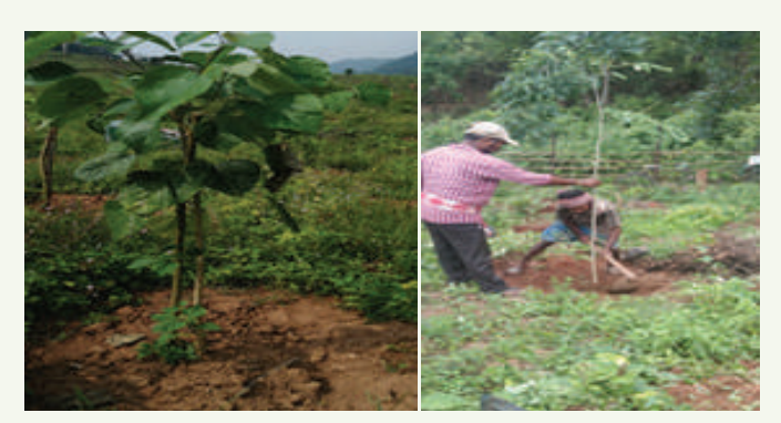
Maintenance of ANR With Gap Plantation at Ramsahi VSS, Balliguda Division