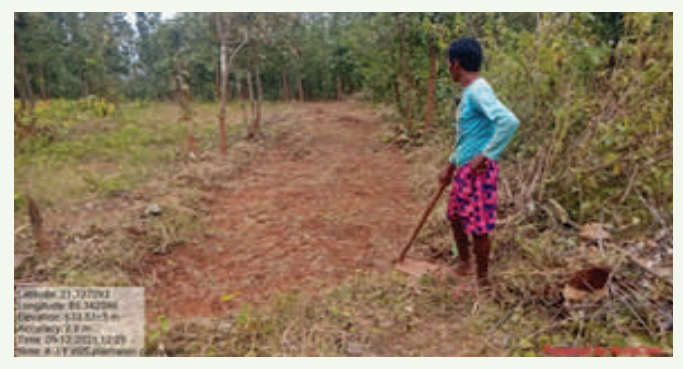
Fire Line creation work at Panasuan ANR plantation site in BJP FMU of Keonjhar Division

The summer season is the crucial time to take protective measures against forest fire incidences. Awareness creation, fire line tracing, cleaning and trenching are being carried out during this quarter in all VSSs. Timely creation of fire lines,