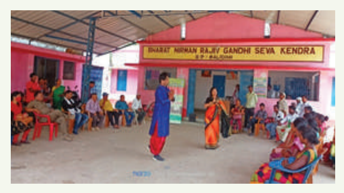
Street play on Environmental Awareness during Celebration of World Environment Day at Malidihi VSS, Rourkela Division