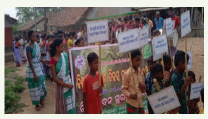
Awareness Rally during Celebration of World Environment Day at Tikira VSS, Keonjhar Wildlife Division