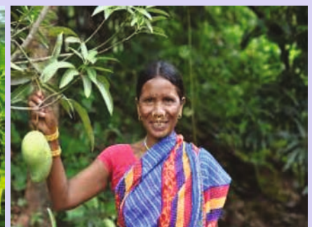
Diversified cropping options introduced in the village for income enhancement