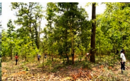
Cleaning and climber cutting at Karangamal VSS, Bamra WL

Assisted Natural Regeneration (ANR) is a key intervention to convert a degraded forest to a more dense forest with low investment. In the AJY divisions, ANR interventions are done in VSS areas with a major thrust on regenerations. Cleaning, high stump cuttings, fire line maintenance, soil and moisture conservation measures etc are some of the major ANR operations. Most of the scheduled activities were completed on time in this quarter.