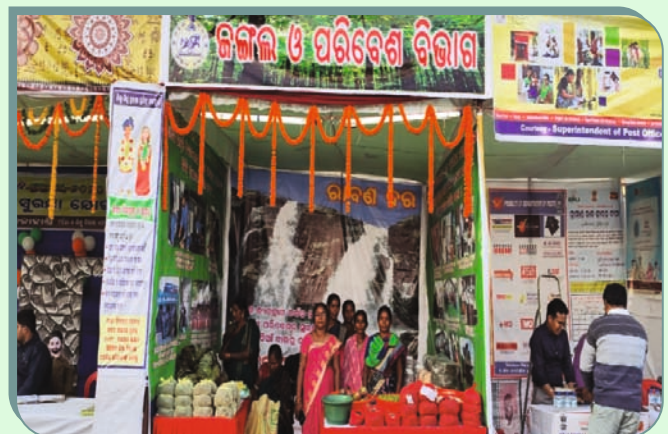
Participation of Ulisirka VSS in district level exhibition