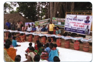
Distribution of LPG Gas Kapundi VSS Keonjhar Division