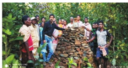
Pillar posting at Nuamunda & Majurdima VSS, Deogarh Division