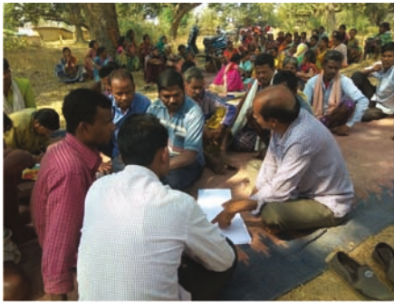
Microplan Preparation, Barab VSS, Bamara (WL)

PRA & Microplanning is a community based empowering process for preparation of road map for development and management of forest and to address the livelihood opportunities of the forest dependent communities. Micro plans have been prepared in a participatory manner in all VSSs involved in AJY. The micro plan at VSS level covers the development plan for sustainable forest management and other livelihood needs for the communities.