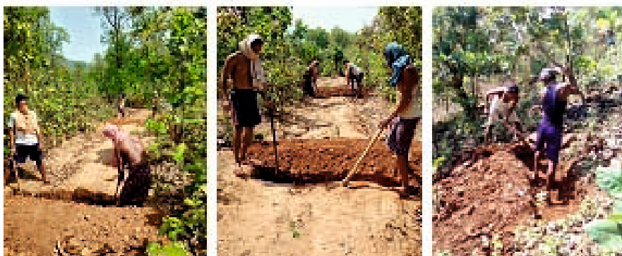
Staggered trenching in Asanpani & Bijadihi VSSs, Deogarh Division