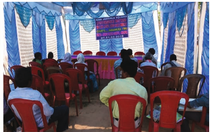
FMU Level Capacity Building Training in Bamra WL Division