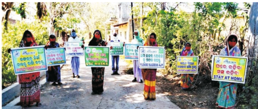
Celebration of World Forestry Day at Angul Forest Division

Awareness generation activities were carried out on the benefits of forest resources and eco system along with how to protect, conserve, regenerate and sustain resilience against climate change effects on nature among all stakeholders of forestry sector. Protection of forests from fire was the major theme during this year. All the activities were carried out maintaining social distance among the members. Glimpses of the program have been given in the photographic presentation.