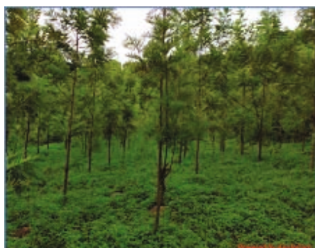
Nandiguda VSS, Koraput Division