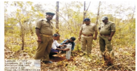
Kotaguda VSS, Malkangiri Division