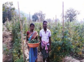
Iga- Organic Vegetable Cultivation through Convergence with ITDA, Majurdima VSS, Deogarh