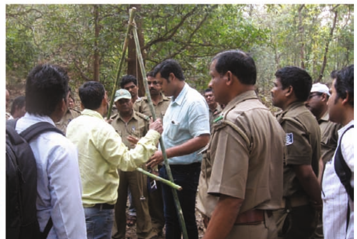
DMU Level Capacity Building Training in Deogarh Division