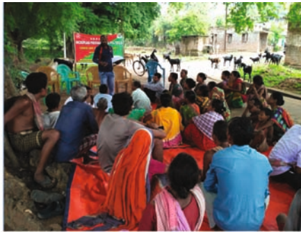
Sunapur VSS, Paralakhemundi Division