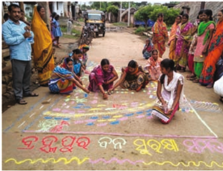
Brahmapura VSS, Angul Division