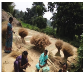
Broom Harvesting and Processing, Haripada VSS, Bamra(WL)