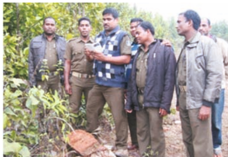
GPS Reading for boundary area demarcation at Mandasila VSS, Deogarh Division

Survey and demarcation is one of the preparatory works under AJY Scheme which is followed after site selection of each VSS. Survey and demarcation is undertaken in the areas assigned to each VSS for coverage under the scheme. During the year, all 540 new VSSs were assigned with a treatment area of about 50 hectares where Assisted Natural Regeneration (ANR) without gap plantation is taken up. The target for Survey, demarcation and pillar posting was completed for 22342 Ha of forest area assigned to 540 newly selected VSSs under 20 Divisions. The work has been accomplished successfully in all target VSSs with accurate GIS mapping.