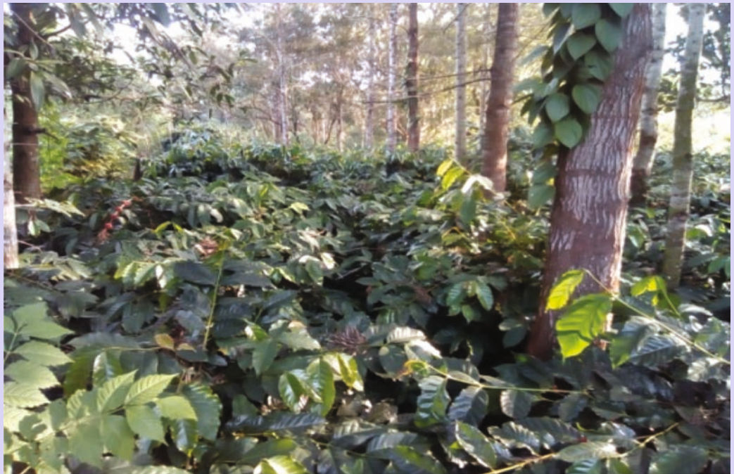
Coffee and Yam intercropped with Silver Oak in 24 acres of a compact patch

Additionally, due to the collective effort by all stakeholders including the project community, the village is now empowered with drinking water facility, domestic toilets and a RCC road inside their village, all within a year time. Their constant and collective effort along with nature loving attributes could fetch them short term income opportunity and long term benefits, which has laid an example for other tribal communities in the similar geography.