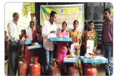
Ujjwala Gas Distribution, Khariar Divn