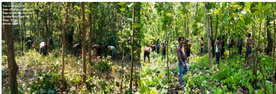
Silvicultural operations in designated forest area under Biru Purunasahi and Kaliakata VSSs, Angul Division