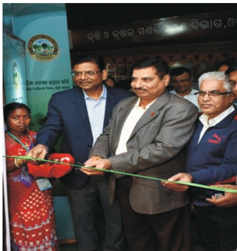
Inauguration of the Stall by the Project Director, OFSDS

belonging to 12 forest Divisions showcased their achievements and used this platform to promote their products, brands and messages to the public through the display of their exhibits in the stalls. The product based display of the materials have attracted many researchers and marketing agencies, which may be helpful for defining a new way of marketing of the new entrepreneurs with the initiatives of OFSDS.