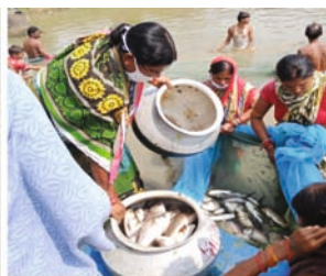
IGA-Pisciculture Through Talkundi VSS, Deogarh Division