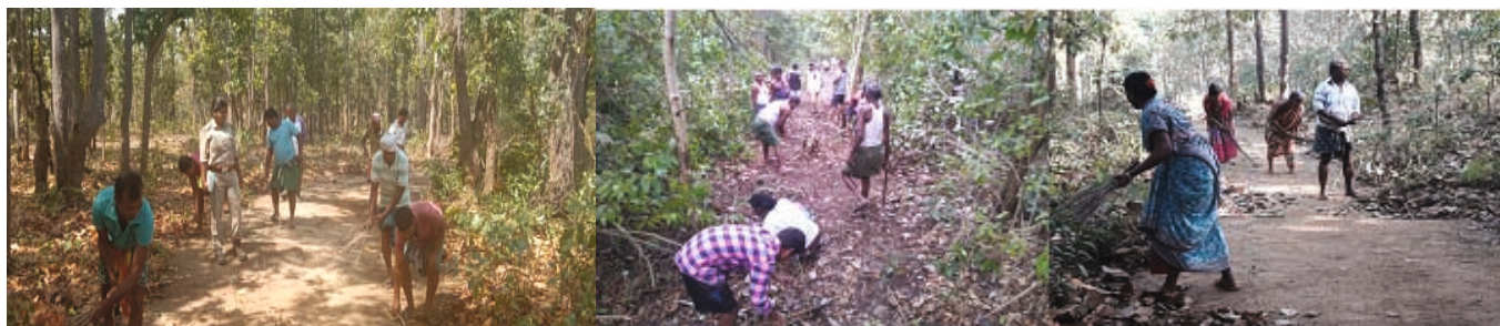
Fireline work in Khinda, Karabira and Dahibara VSS under Angul Division

Fire protection is one of the thrust areas of AJY. This involves timely creation of fire lines, awareness generation and engagement of fire watchers. These activities are done with the active involvement of VSS members and Forest Department staff and this has translated into exemplary success stories of Fire Management.