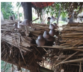
IGA -Mushroom Cultivation, Seegarh VSS Under Deogarh Division

Securing the income and livelihoods and providing wage based employment to the poor and needy community members is a big challenge. However our committed team members have made extraordinary effort to make it happen, in spite of many challenges. This was made possible through convergence initiatives taken up by the AJY team to ensure schematic benefit to the VSS and SHG members. The effort initiated at various levels has been showcased in the pictures below.