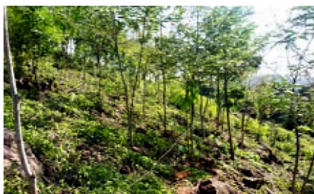
Cleaning work at Epamanpadu VSS, Koraput Division