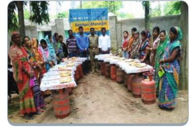
Ujjwala Gas Distribution Kalahandi (N) Divn