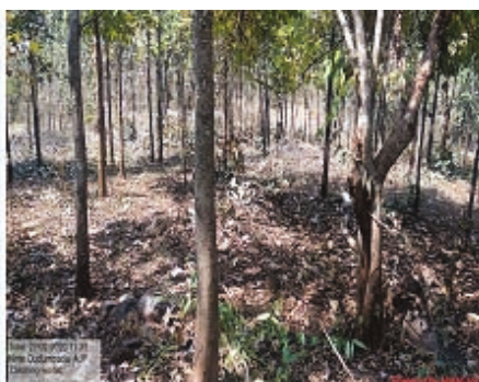
Pradhaniput VSS, Koraput Division

Block plantation by suitable tree species was made in 1010 Hectors of area during initial 3 years of project intervention under Ama Jangala Yojana. Maintenance and after care activities of plantation has been carried out for the previous block plantation patches in the subsequent years.