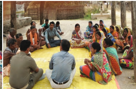
VSS Meeting at Ambapal Nuasahi and Burti VSSs, Angul Division