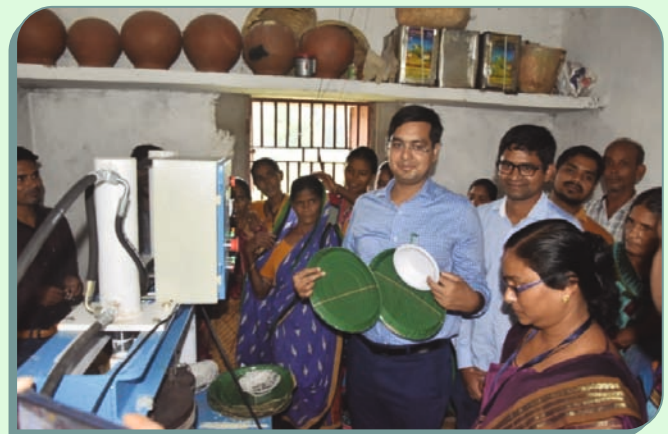
Demonstrating the quality of Leaf Plates by the VSS Members