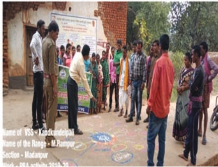
Kundeipali VSS, Kalahandi-N Division