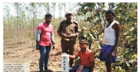
Temraguda VSS, Jeypore Division