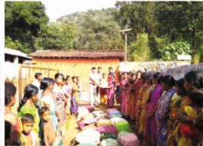
Back Yard Poultry Support through PBDA Convergence – Ballidih VSS, Deogarh