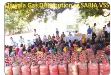
Ujjwala Gas Distribution at SARIA VSS

Cross sector convergence is one of the important mandates of Ama Jungle Yojana. During the reporting period, many activities have been undertaken in convergence with various departmental schemes and programs, out of which linkage of VSS members with PM Ujjwala Scheme for LPG connection with Chullah and CFL Bulb was most important for ensuring cooking gases and lighting equipment to forest fringed households. There are about 680 numbers of new connections ensured during the last quarter in 12 Forest Divisions.