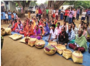
Bamboo based Livelihoods Improvement, Barhmapur VSS, Angul Division