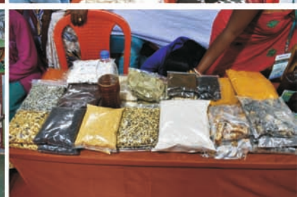
Display of products and inner view of OFSDS Stall at Adivasi Mela-2020