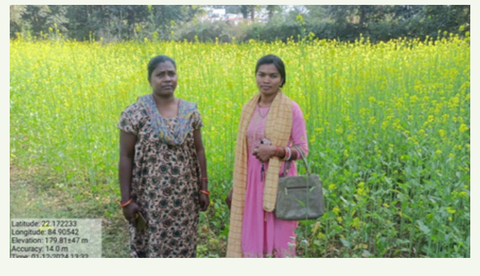
Mustard Cultivation by SHG members at Kharuatoli VSS of Rourkela Forest Division