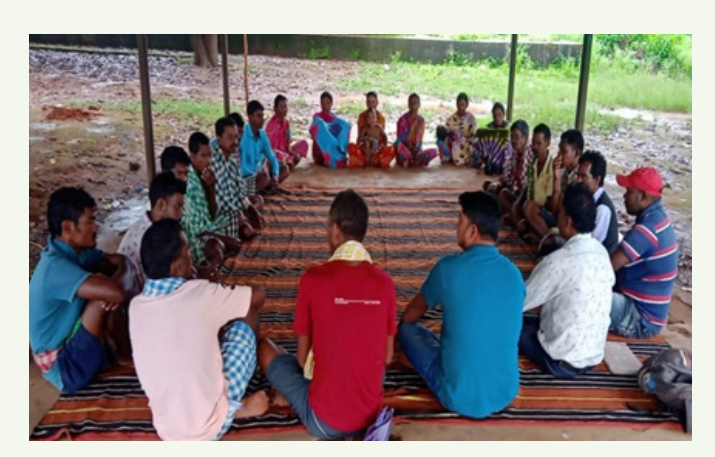
Meeting with SHG members at Karalapasi VSS, Keonjhar Division