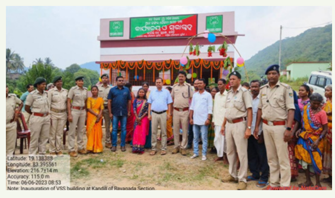
VSS Building-cum-IGA Facilitation Centre inauguration at Kandili VSS, Rayagada Division

construction of VSS building of about 400 sq. ft. in selected VSSs. During the Project period (up to 2023-24), 612 Nos. of VSS Building-cum-IGA Facilitation Centers have been constructed and handed over to the concerned VSSs for multipurpose use.