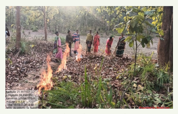
Fire Line creation work at Mardanga VSS, Deogarh Forest Division