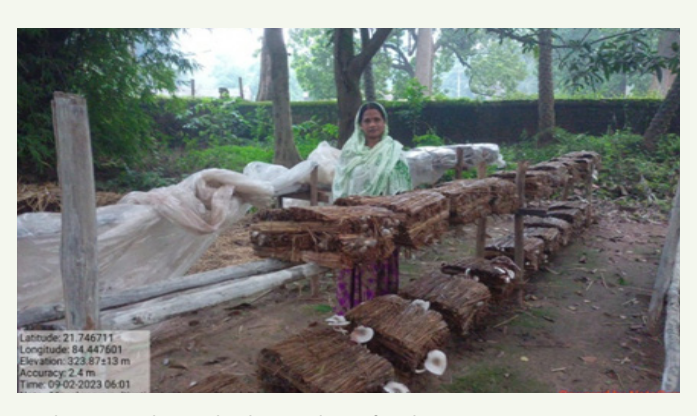
Mushroom production by the members of Laidaguna VSS, Bamra WL Division