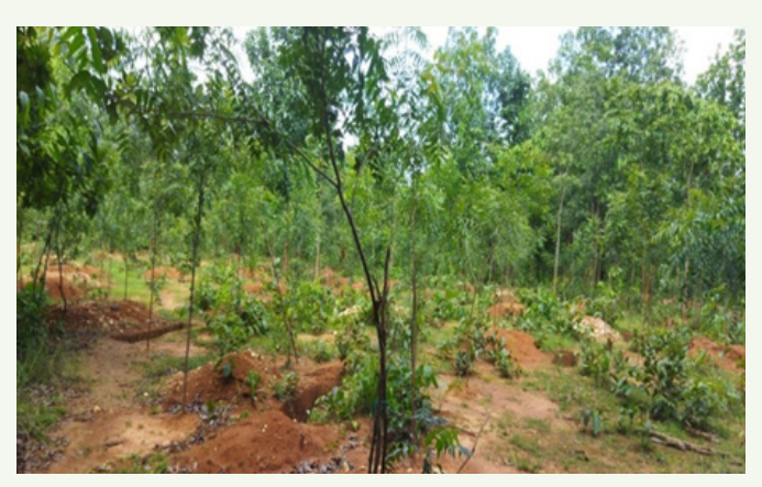
ANR Plantation monitoring at Sundhiguda VSS, Jeypore Division