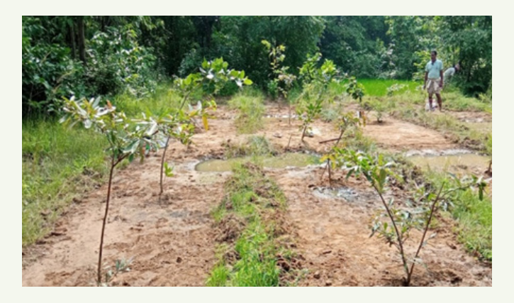
ANR Maintenance work at Bhulkabahal VSS, Deogarh Division