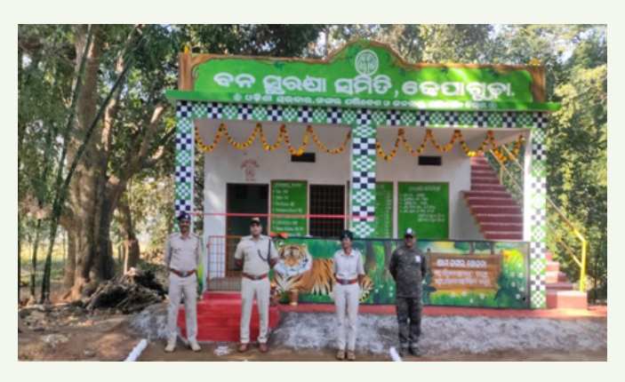
VSS Building-cum-IGA Facilitation Centre at Dhepaguda VSS, Jeypore Division