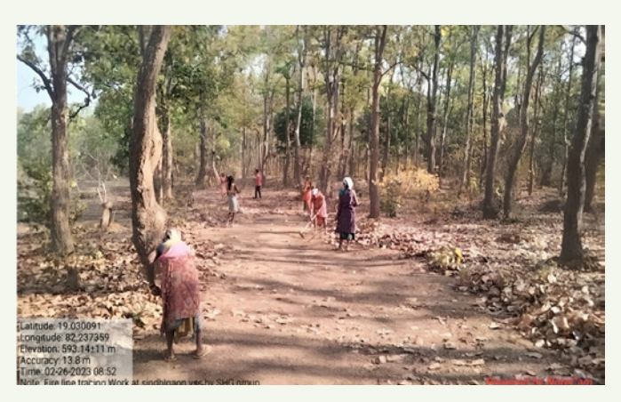
Fire Line creation work at Sindhigaon ANR site, Jeypore Forest Division