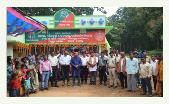
VSS Building-cum-IGA Facilitation Centre at Bhaludunguri, Bargarh Division