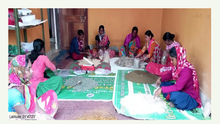
Members of Sandyarani SHG, Bonai Division preparing their products for selling