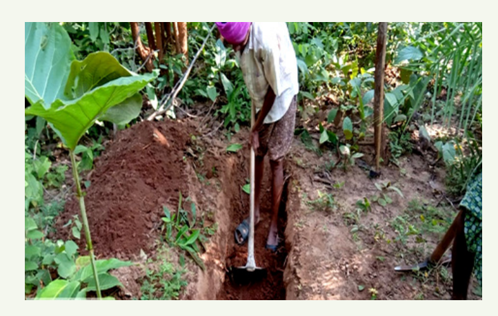
Renovation of staggered trench at Muribahal, Bolangir Division

Moisture Conservation measures (SMC) are one of the vital components under AJY. During the year 2023-24, renovation of staggered trenches within the forest area, Loose Boulder Check Dams (LBCD) are some of the major SMC activities carried out in 69,837 ha. of Assigned Areas of the Project.