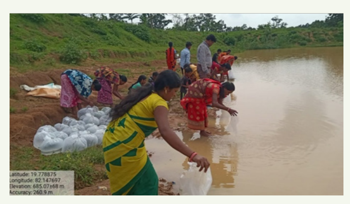
Pisiculture by SHG members under Ratanguda VSS, Nabarangpur Division