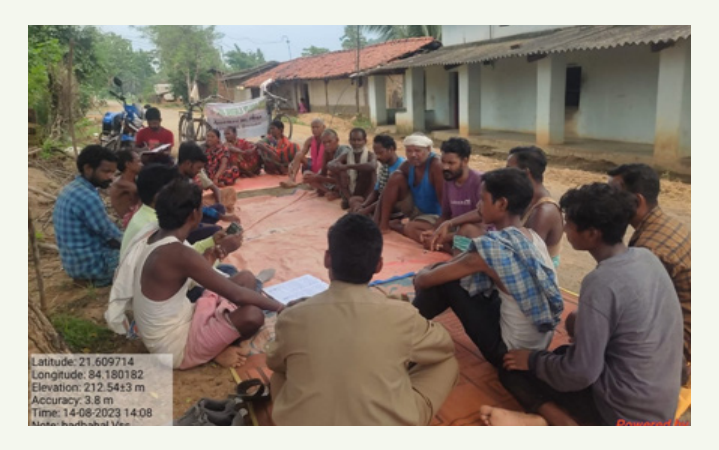
VSS GB meeting at Gamhardihi VSS, Redhakhol Division