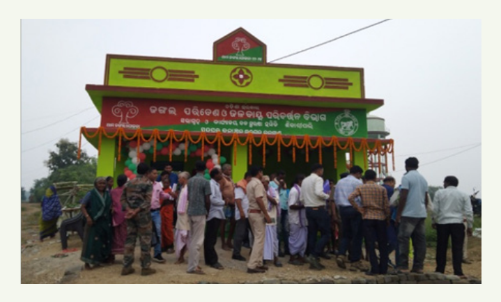
Inauguration of VSS Building at Sikaripalli, Bargarh Division