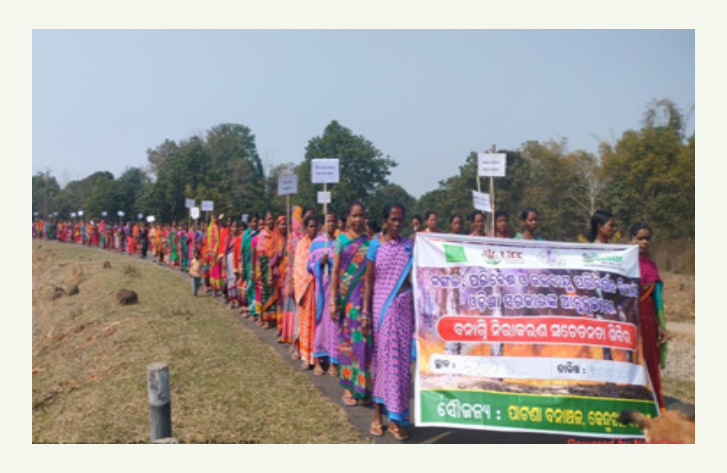
Forest fire prevention awareness rally by the VSS members under Patna FMU of Keonjhar Division

Timely creation of fire lines, engaging fire protection watchers and conduct of fire awareness measures are the activities that have been taken up during the project period under vigilant observation by the Forest Department and Project personnel under AJY. As a result, the VSSs have been efficiently activated and the forest fire incidences have been controlled to a large extent in spite of soaring summer temperatures and long prevailing dry spells during the present quarter.