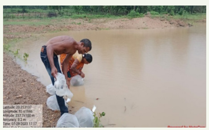
Livelihood Promotion Activities (vegetable cultivation, fruit orchard development and pisciculture) through convergence with Schemes of Line Departments by the members of Putupada VSS, Khariar Forest Division