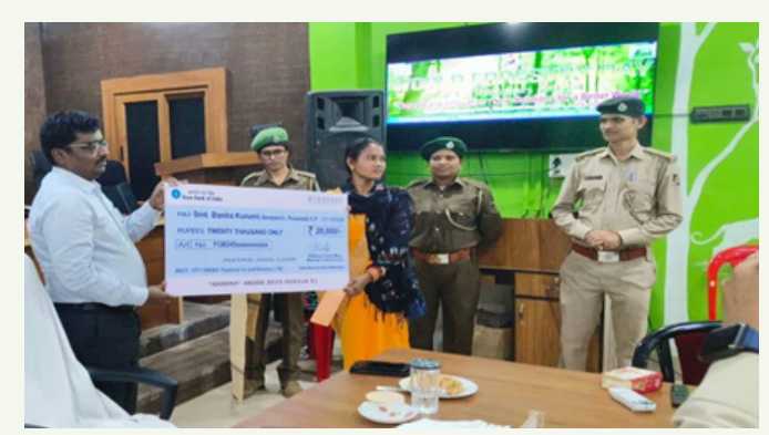
World Forestry Day celebration at Malkangiri Forest Division