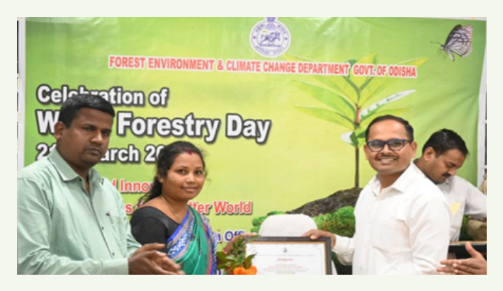
World Forestry Day celebration at Keonjhar Forest Division