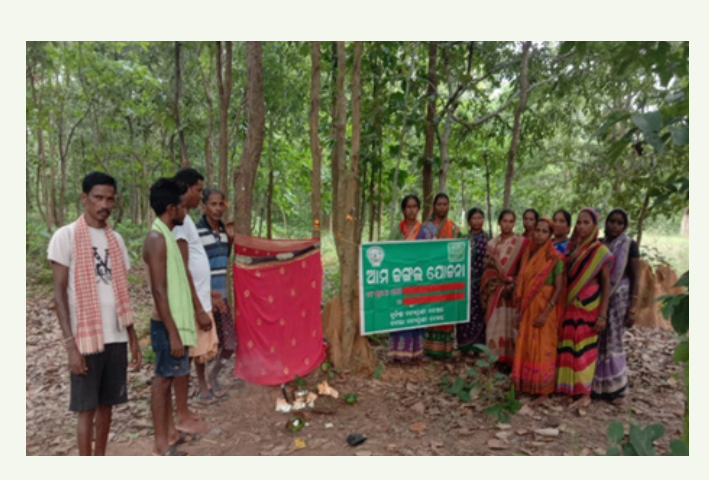
Rakshya Bandhan for Forest Protection Awareness at Tamanguda VSS, Bamra Wildlife Division

The forest fire management under AJY involves timely creation & maintenance of fire lines, awareness generation among local people, involvement of local public and Community Based Organizations (CBOs) in early detection, message dissemination and control of forest fires in the assigned areas, and engagement of fire watchers in the forest areas assigned to each VSS. These activities are performed with the active involvement of VSS members and Forest Department staff. The awareness generation through meetings at community, School and college level, organizing awareness rallies and street plays, inter-Departmental coordination meetings for forest fire prevention, involvement of women SHGs and swift action by the fire response team by the project has a great impact