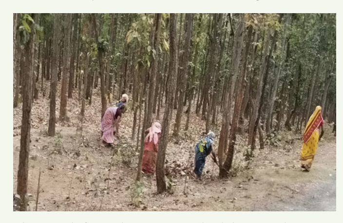
Cleaning work of ANR without Gap site at Badapichula VSS, Keonjhar Division