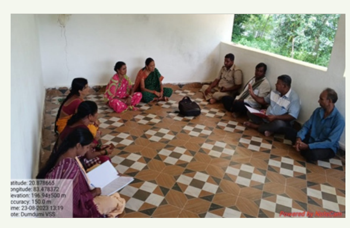
VSS EC meeting at Dumdumi VSS, Bolangir Forest Division