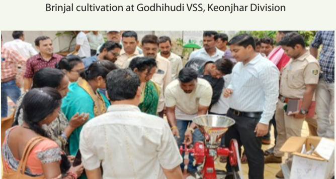
DMU level training to VSS members on use of machinaries at Bolangir Division