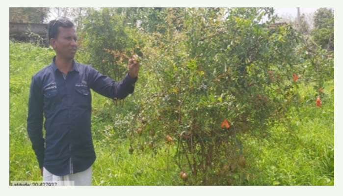
Pomegranate plantation in Bodlapada VSS, Khariar Division