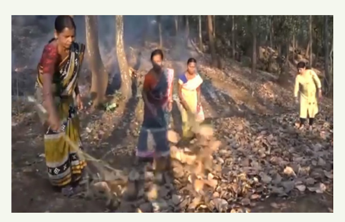
Women SHG members volunteering fire extinguishing at Kambinaju VSS, Phulbani Forest Division