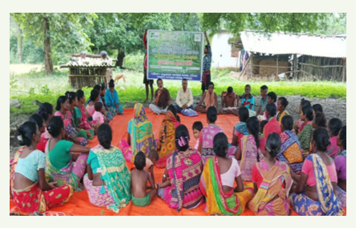
VSS GB meeting for Livelihood Planning at Suakati VSS, Keonjhar WL Division