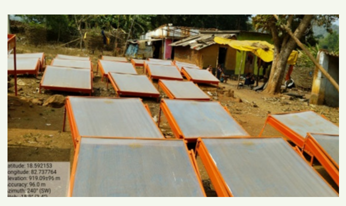
Dry ginger making machines for distribution