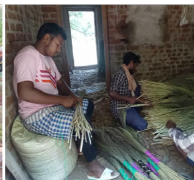
Harvesting broom sticks and making of brooms

Hill Broom was cultivated in four acres of land without any input cost by the farmers. After about 12 months of planting, the beneficiaries were able to harvest the Hill Broom and earn Rs. 40,000/-each from sale of the first harvest. Thereafter, they were able to get a good amount of money from the sale of subsidiary harvest and intercrops. All of them are now preparing their nurseries for production of hill broom seedlings for supporting other interested farmers.