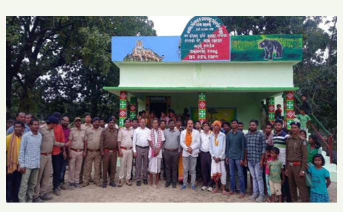
VSS Building-cum-IGA Facilitation Centre at Chedenga, Malkangiri Division