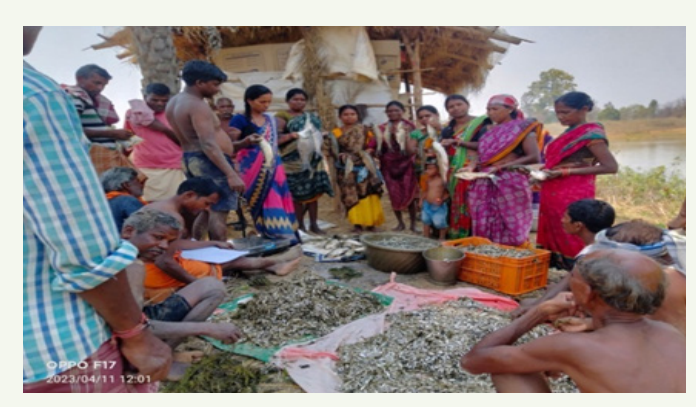
Sale of fish by the members of Laidaguna VSS, Bamra WL Division