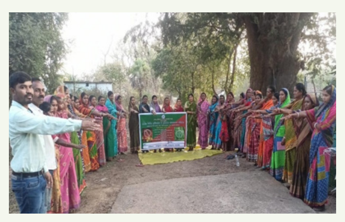
Forest fire prevention oath taking at Keonjhar Division