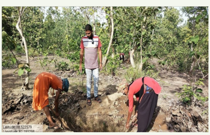
Renovation of staggered trench at Madkamiguda VSS, Malkangir Division

Soil & Moisture Conservation (SMC) measures are the major sub-components under ANR operations. These measures are meant to conserve rain water, recharge ground water, arrest run-off, enhance percolation, retain moisture across the forest floor and check soil erosion which promotes growth of forest vegetation. Hence, Soil &