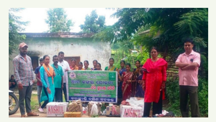
Distribution of poultry chicks to SHGs at Jugsaipatna VSS, Kalahandi (S) Division