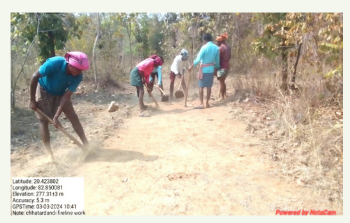
Fireline work at Bolangir Forest Division