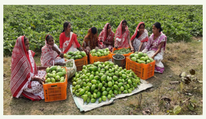
Vegetable Cultivation through Convergence at Hayerpur VSS, Keonjhar Wildlife Division