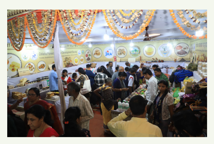
Overview of products display in OFSDS Stall and sale in progress