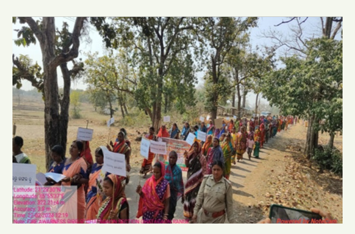
Forest fire prevention awareness rally by the VSS members under Ghatagaon FMU of Keonjhar Division