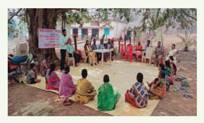
Mushroom cultivation training through Convergence at Redhakhol FMU, Redhakhol Division

have been conducted through convergence involving the 28,820 members of VSS & women SHGs of the project area during the present quarter.