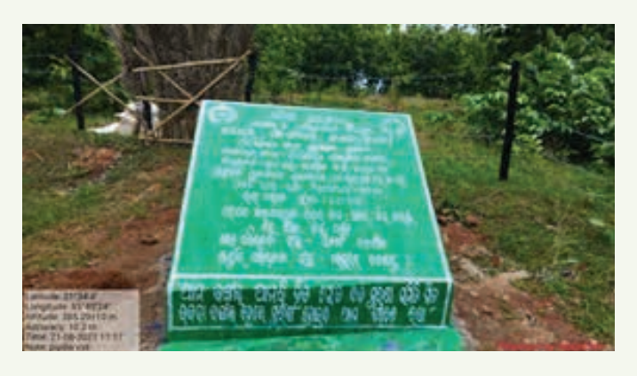
Plantation Sign Board of Pipilia VSS in Ghatgaon Range, Keonjhar Division