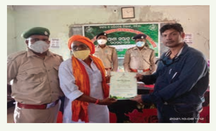
Mangalpur VSS of Keonjhar Division has been honoured as Prakruti Mitra Awards during the Vanamahotsaha-2021

Many innovative models and success stories have been created by the continuous effort of the project personnel and VSSs during this period. Some of them are worth replication in other areas and are included here to encourage other VSSs.