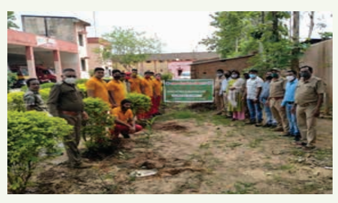
Celebration of Vanamahotsav at Khariar Division Khariar Division