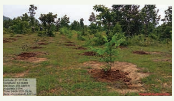
ANR with Gap Plantation at Khuntabandh VSS, Deogarh Division