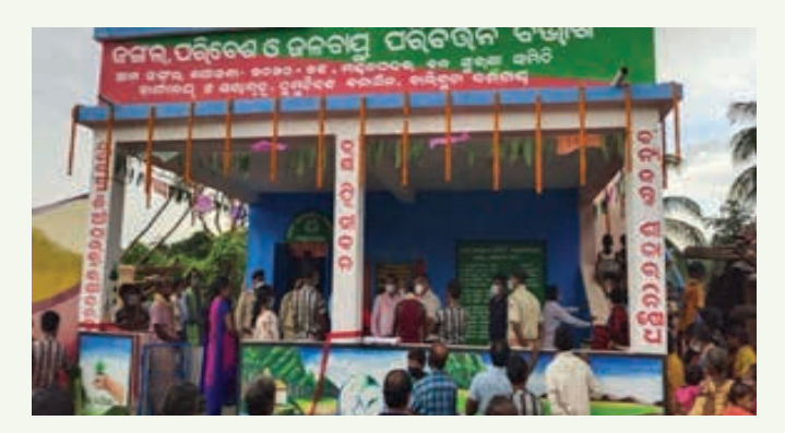
VSS building cum meeting hall at Mandalpadar VSS, Baliguda Division

There was a provision for construction of 165 numbers of multipurpose VSS buildings in the villages under AJY during