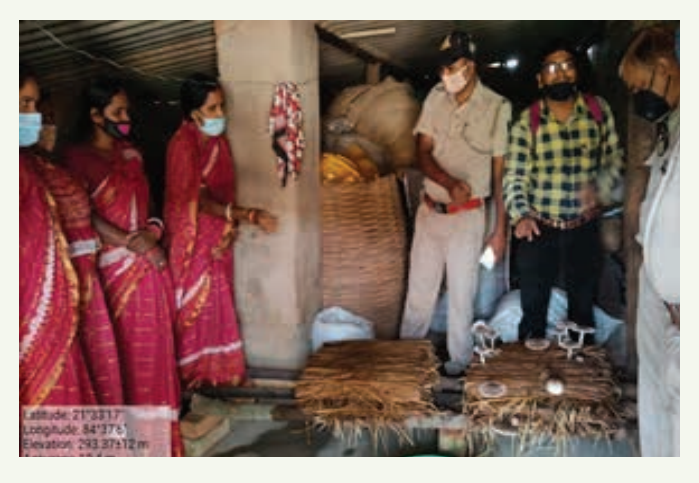
{\it Mushroom\ production\ through\ convergence\ with\ OLM\ at\ Jareikela\ VSS,\ Deogarh\ Division}

other Departments under different Schemes, benefitting about 1,58,863 persons during this quarter. In addition to this, the AJY team has accomplished many activities pertaining to community infrastructure development and livelihood improvement for the benefit of the forest fringe communities. Some major initiatives taken during this quarter are presented in brief.