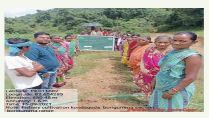
Motivational training to SHG members for Pisciculture in Kondaguda VSS, Borigumma FMU of Jeypore Division