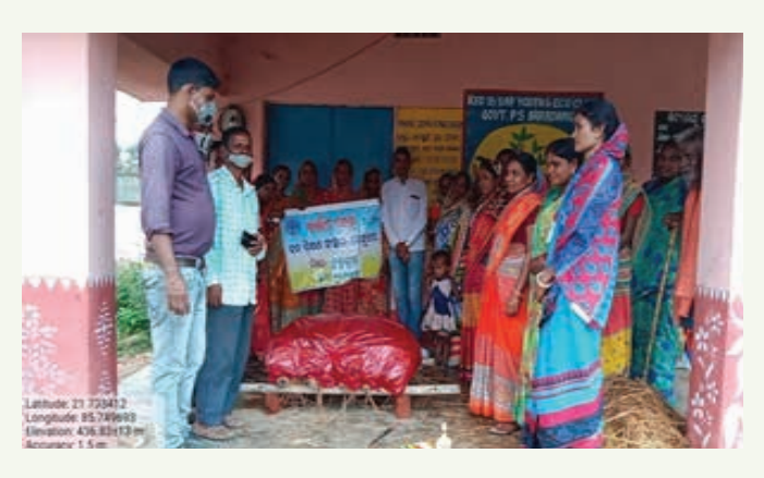
Mushrrom Cultivation training to SHGs at Baradangua VSS, Keonjhar Division