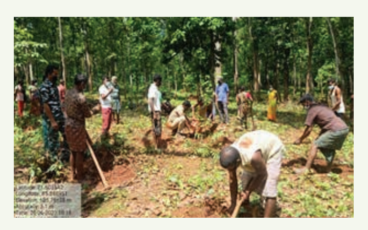
ANR with Gap Plantation at Balibahal VSS, Deogarh Division