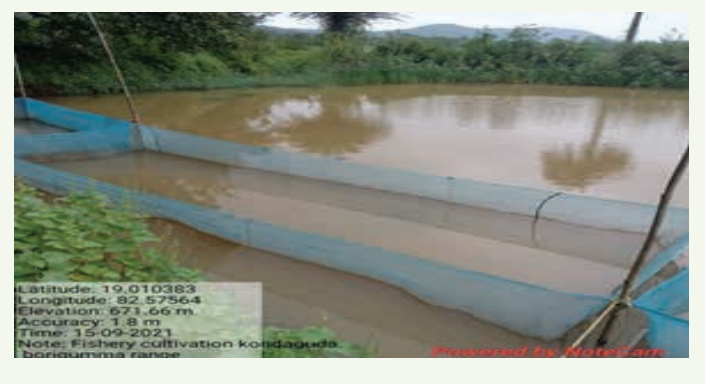
Pisciculture in convergence with Fishery Dept. through SHGs at Kondaguda VSS, Jeypore Division