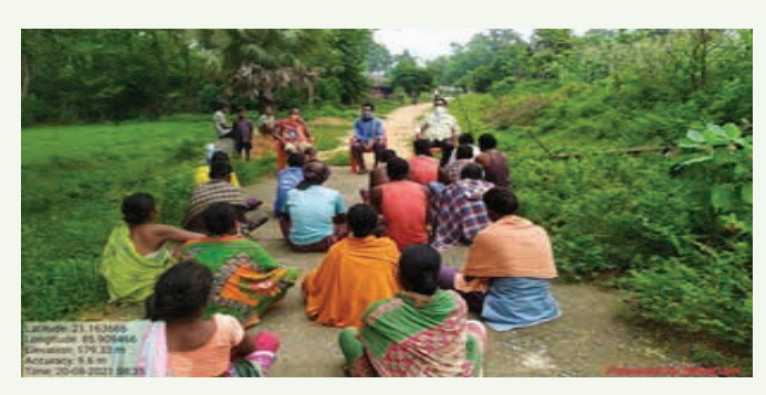
EC meeting at Rangamatia VSS, Keonjhar (WL) Division