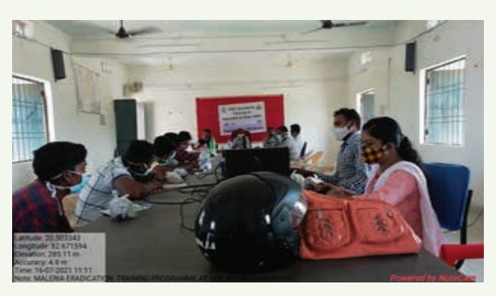
Awareness meeting on Maleria and Dengue at Bagapada VSS, Khariar Division