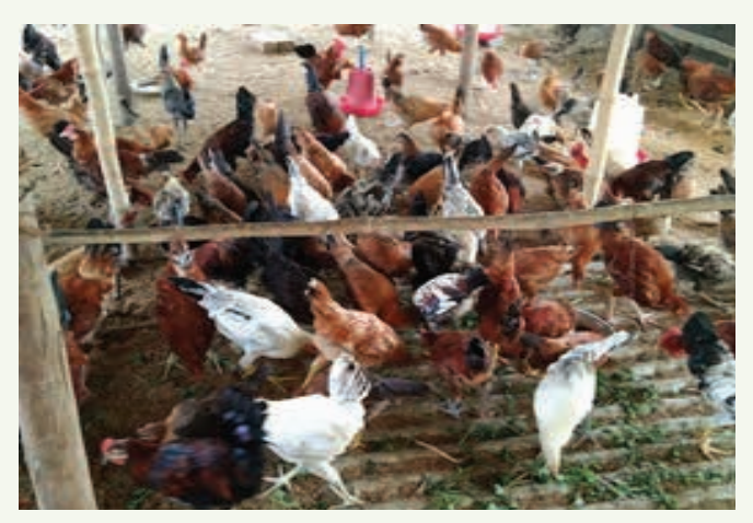
Poultry rearing by Santuakala VSS members

The KKDA authorities along with the Forest Department staff made an appraisal visit to the village and selected 25 beneficiaries for implementation of the poultry based livelihood intervention. The beneficiaries were supplied with poultry basket along with chicks and accessories to 25 beneficiaries of Santuakala VSS as a revolving support worth of Rs. 10,000/- per beneficiary. This small amount of support could be able to fetch larger benefit for the inhabitants of the village in terms of nutritional security and income. Through this support, the VSS members are now able to earn Rs. 12,000/- to 15,000/- per month from sale of eggs and live birds. Country bird rearing is now a popular practice among the VSS members to earn additional income for their living. "This type of small, but useful intervention is extremely suitable for enhancing the household income of the villagers in the tribal landscape in Odisha"- Opined by the Divisional Forest Officer, Balliguda "This also reduces the loss of forest resources as the dependency of the local people on forest is reduced due to alternative engagement".