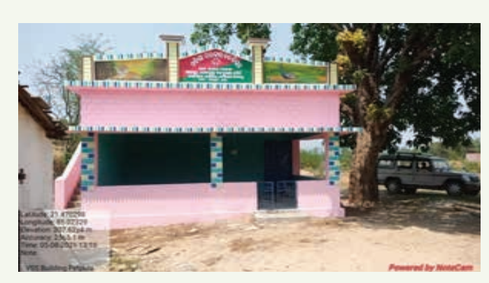
VSS building cum office at Petpura VSS, Deogarh Division

the last year. By September, 2021, all the VSS buildings have been completed and handed over to the communities