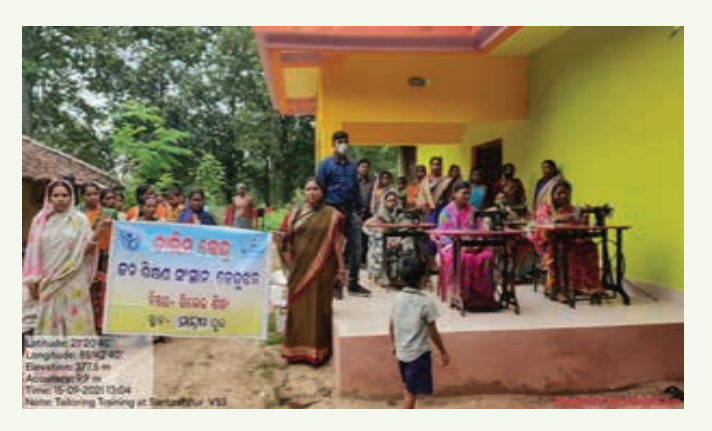
Tailoring training at Santoshpur VSS of Ghatgaon Range, Keonjhar Division