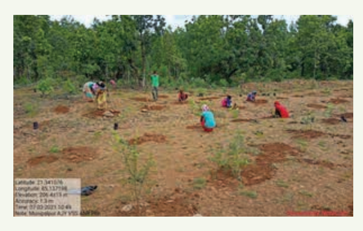
ANR with Gap Plantation at Munipalpur VSS, Deogarh Division

maintenance work for Assisted Natural Regeneration (ANR)-without gap plantation has been carried out in 75,837 ha of assigned area under 1965 VSSs.