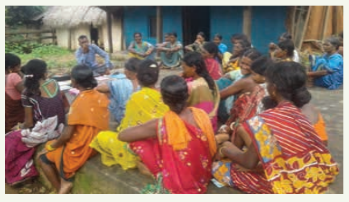
Dengue & Malaria awareness meeting at Gupteswar Range, Jeypore Division