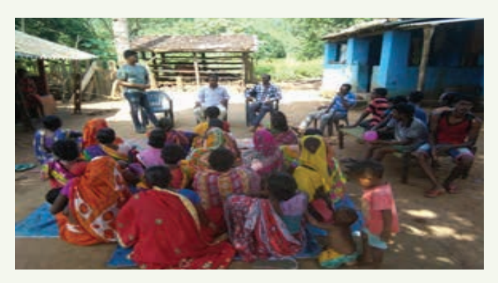
\it VSS~level~IGA~Planning~meeting~at~\it Jhariapada~\it VSS, Baliguda~\it Division