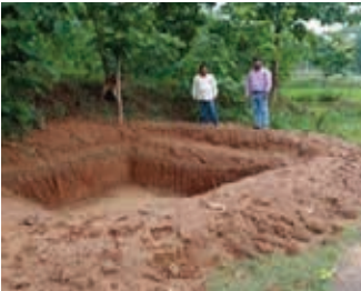
Earthen Compost pit support by the Panchavati Rai Dept.