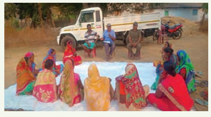
{\it SHG meeting for IGA planning at Badhamunda VSS, Deogarh\ Division}