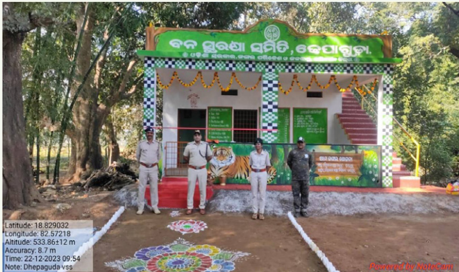
VSS Building-cum-IGA Facilitation Centre at Dhepaguda VSS, Jeypore Division