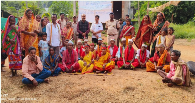
Advisor, AJY Visits to Palukhola VSS, Paralakhemundi Division