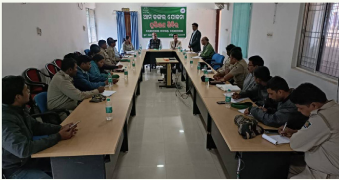
Advisor, AJY reviews the AJY activities at Redhakhol Division