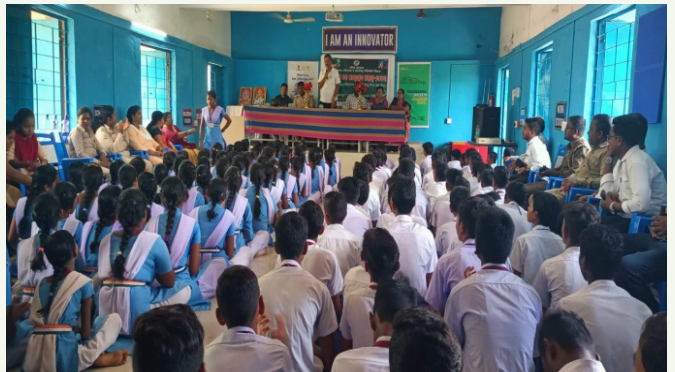
Awareness building among Students at Khalasuni Range of Bamra Wildlife Division