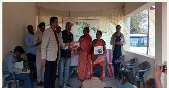
Advisor, AJY offers patrolling lamps to the VSS members at Lambtidadar VSS, Redhakhol Division