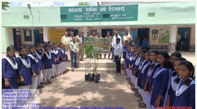
Environmental awareness among School children at Uchhala Girls' HS, Jaipatna, Kalahandi (S) Division