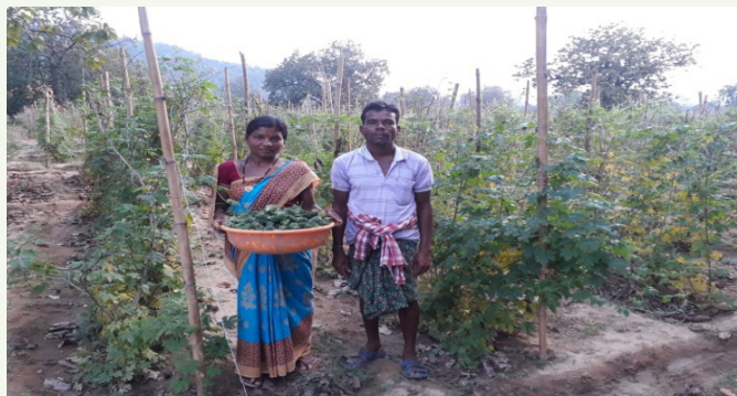
Vegetable cultivation support to VSS members at Bhulukabahal VSS, Deogarh Division