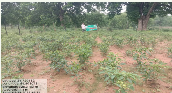
Chilli cultivation at Pudiakhaman VSS, Bamra WL Division