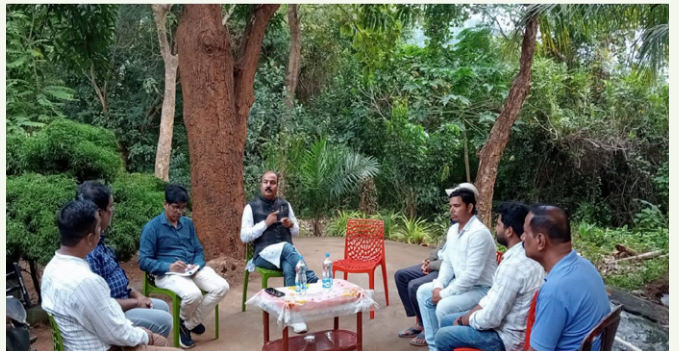
Advisor, AJY reviews the AJY activities at Gandahati Nursery, Paralakhemundi Division