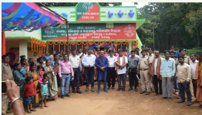
VSS Building-cum-IGA Facilitation Centre at Bhaludunguri VSS, Bargarh Division