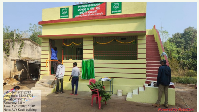
VSS Building-cum-IGA Facilitation Centre, Kasili VSS, Rayagada Division