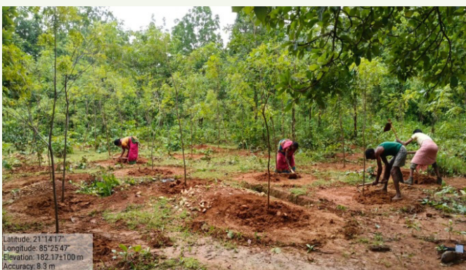
Weeding and soil working at Gopinathpur VSS, Keonjhar Division