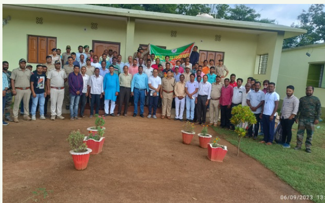
Range level VSS forum meeting at Keonjhar Range, Keonjhar Division