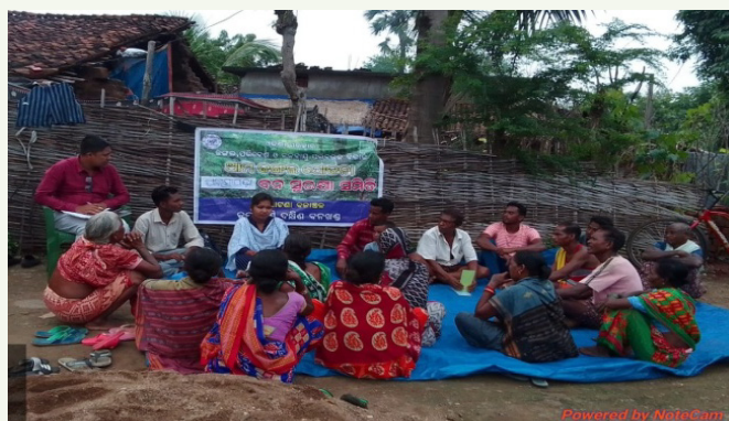
VSS EC Meeting at Palsapada VSS, Kalahandi South Division