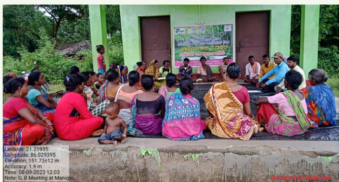
Business Plan Preparation at Manigiri VSS, Keonjhar Wildlife Division