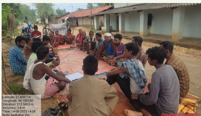
GB meeting at Gamhardihi VSS, Redhakhol Division