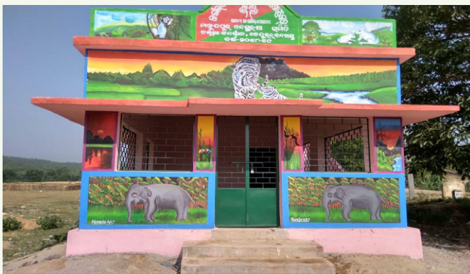
VSS Building-cum-IGA Facilitation Centre, Mukundpur VSS, Keonjhar Division

Provision has been made under AJY for construction of VSS building of about 400 sq. ft. in selected VSSs. During the Project period (up to December, 2023), 612 Nos. of VSS Building-cum-IGA Facilitation Centers have been constructed and handed over to the concerned VSSs.