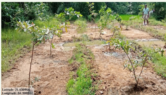
3rd year maintenance work at Bhulkabahal VSS, Deogarh Division