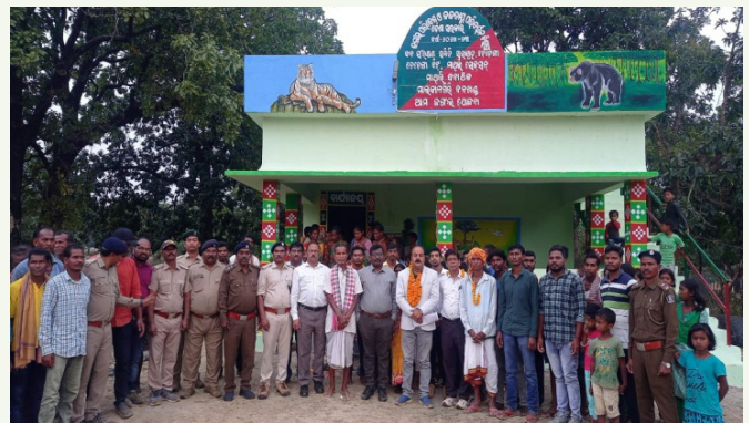
Inauguration of VSS Building-cum-IGA Facilitation Centre at Chedenga VSS, Malkangiri Division