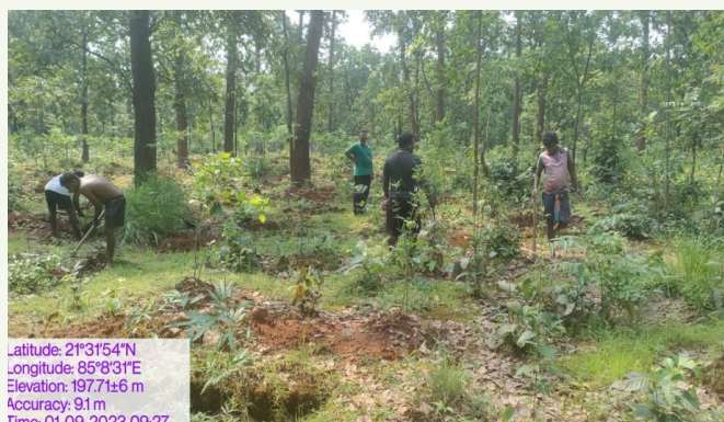
ANR with Gap Plantation at Remalasaahi VSS of Deogarh Division