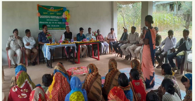
Advisor, AJY Visits Saralapadara VSS, Paralakhemundi Division