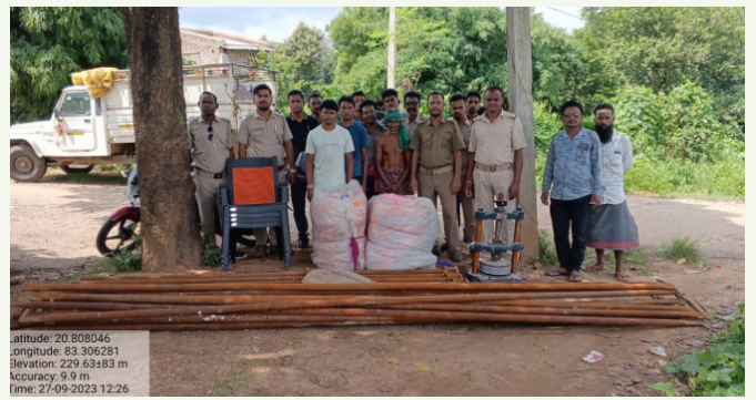
Support for livelihood promotion at Tabalbanji VSS, Bolangir Division