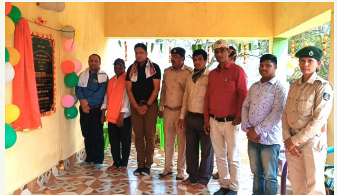
Inauguration of VSS Building at Dhabadi VSS, Keonjhar WL Division