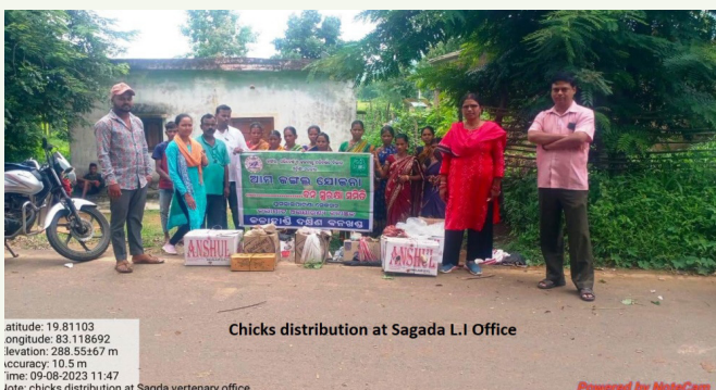
Chicks distribution at Sagda L.I Office Distribution of poultry chicks to SHGs at Jugsaipatna VSS, Kalahandi (S) Division