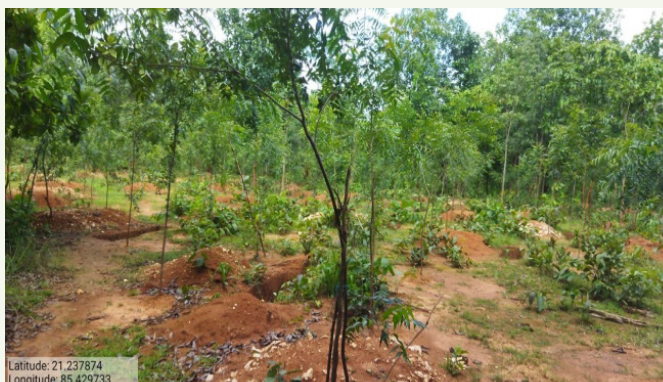
ANR with gap plantation at Gopinathpur VSS of Keonjhar Division

Divisions. This includes 3rd year maintenance of 19,975 ha of ANR with gap plantation covering 445 VSSs sites under 18 Forest Divisions and 69,837 ha of ANR without gap plantation covering 1424 VSSs under 22 Forest Divisions.