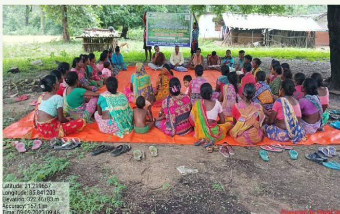
VSS GB meeting for Livelihood Planning at Suakati VSS, Keonjhar WL Division