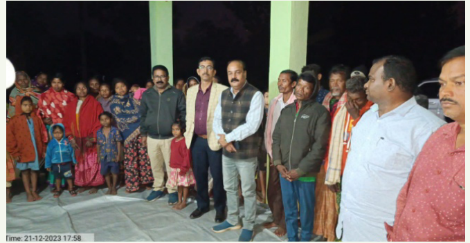
Advisor, AJY Visits Barahampura VSS of Redhakhol Division and interacts with the VSS members