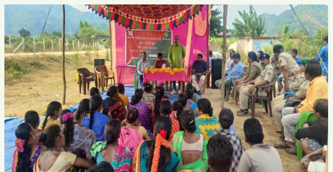
Advisor, AJY interacts with the VSS members at Chinariguda VSS, Rayagada Division