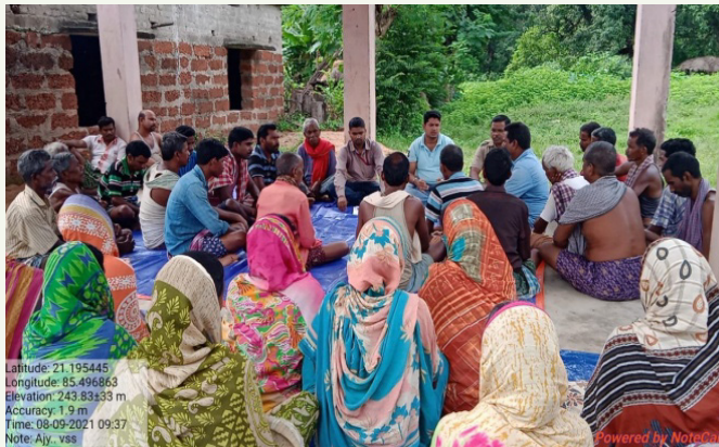
G.B. meeting at Badabahal VSS, Bamra WL Division