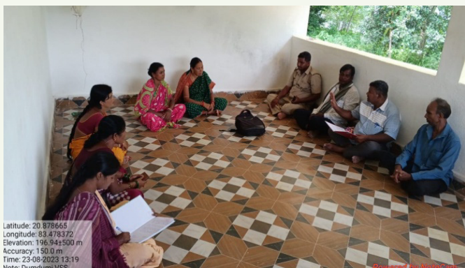
VSS EC meeting at Dumdumi VSS, Bolangir Forest Division