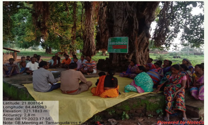
GB Meeting at Tamanguda VSS, Bamra WL Division