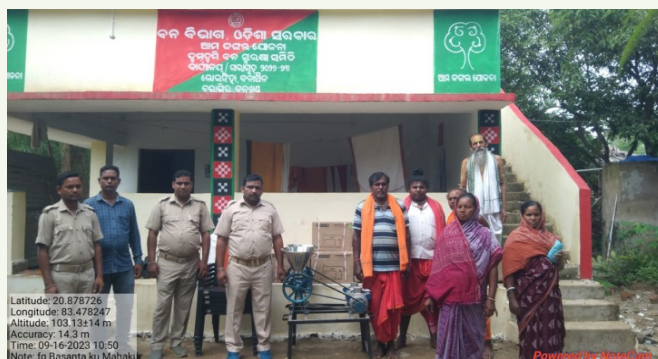
Agro processing machinery support to members of Dumdumi VSS, Bolangir Division