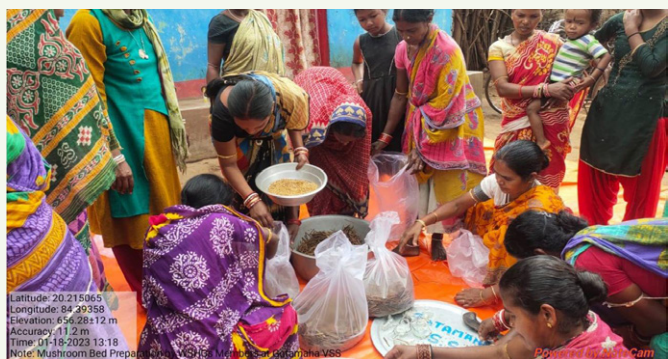
Mushroom Production Training at Gangamata SHG, Gatamaha VSS, Phulbani Division