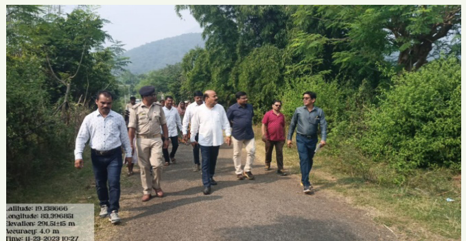
Advisor, AJY walks through the ANR site at Kandilii VSS, Rayagada Division