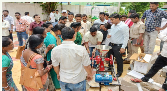
DMU level training to VSS members on use of machinaries at Bolangir Division