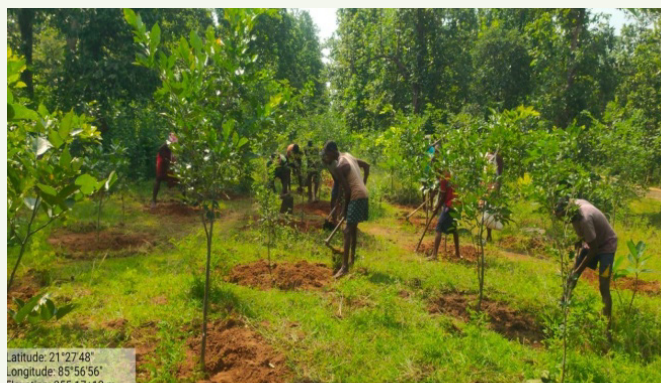
3rd year maintenance work at Kandiguda VSS, Keonjhar Division