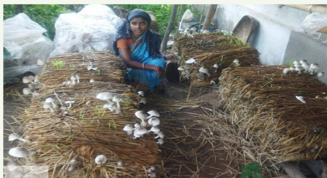
Mushroom cultivation at Naigaon VSS of Keonjhar Division