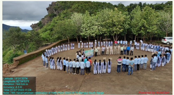
Awareness building among Students at Th. Rampur North Range of Kalahandi South Division