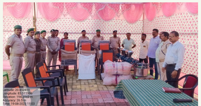
Support for livelihood promotion to VSSs at Loisingha Range Office, Bolangir Division