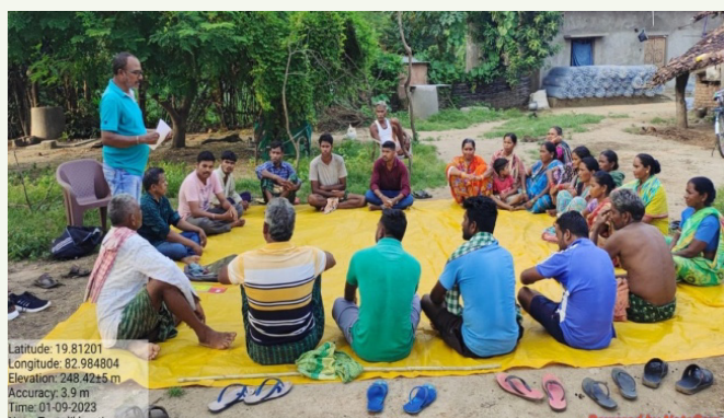
GB meeting at Tentulikhunti VSS, Kalahandi South Division