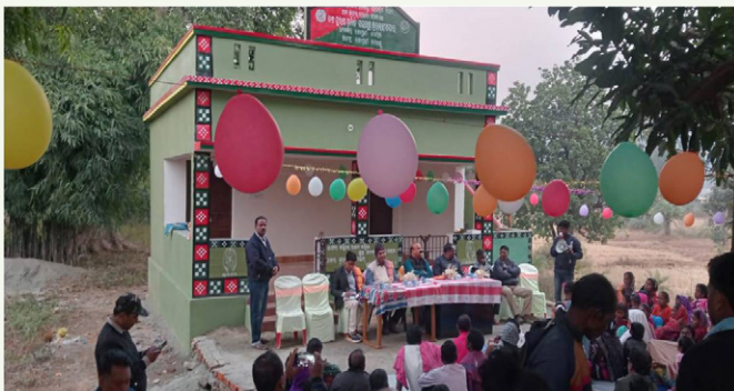
Advisor, AJY Visits Kuilarjor VSS building of Bamra WL Division and interacts with the VSS members