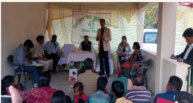
Advisor, AJY Visits Lambtidadar VSS building of Redhakhol Division and interacts with the VSS members