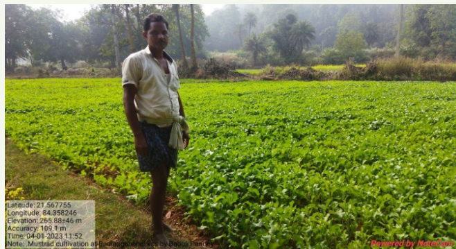
Mustard cultivation support to VSS members at Bhulukabahal VSS, Deogarh Division