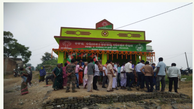
Inauguration of VSS Building-cum-IGA Facilitation Centre at Sikaripalli VSS, Bargarh Division