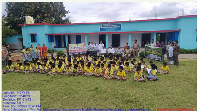
Environmental awareness among School children at Jaipatna EM School, Kalahandi (S) Division