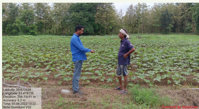
Cultivation of Okra through convergence at Dumdumi VSS, Bolangir Division