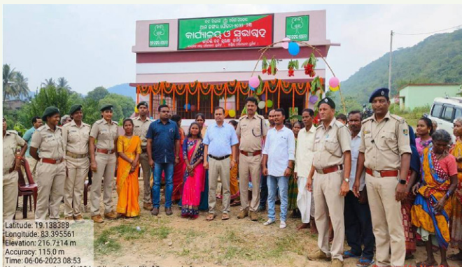
VSS Building-cum-IGA Facilitation Centre inauguration at Kandili VSS, Rayagada Division