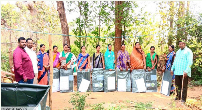
Support for Livelihood Promotion & Income Generation Activities through Convergence through AJY