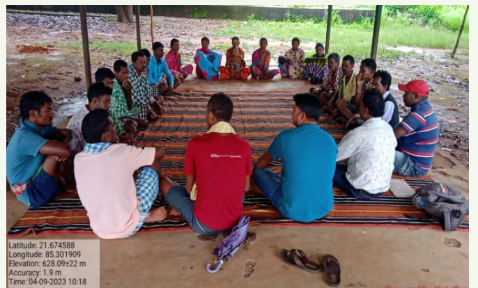
Women SHG meeting at Karalapasi VSS, Keonjhar Division