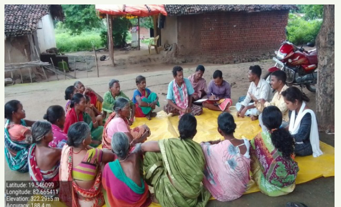
SHG meeting for Livelihood Planning at Kholiamunda VSS, Kalahandi South Division