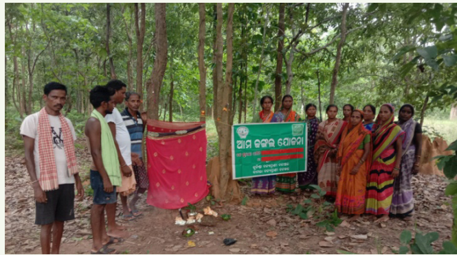
Rakshya Bandhan for Forest Protection Awareness at Tamanguda VSS, Bamra Wildlife Division