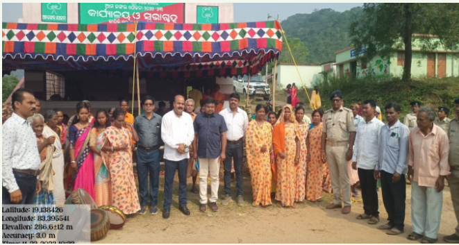
Advisor, AJY Visits Kandili VSS building of Rayagada Division and interacts with the VSS members