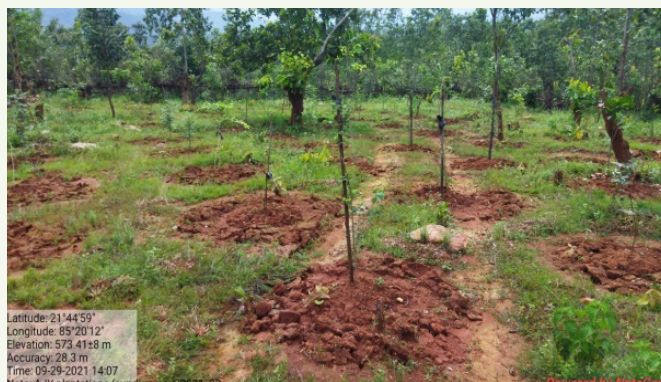
Maintenance work of ANR with Gap site at Sundra VSS, Keonjhar Division