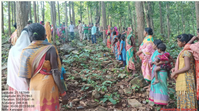
Rakshya Bandhan for Forest Protection Awareness at Kanjiapal VSS, Keonjhar Wildlife Division

and regeneration. Some of them are highlighted below in pictorial form.