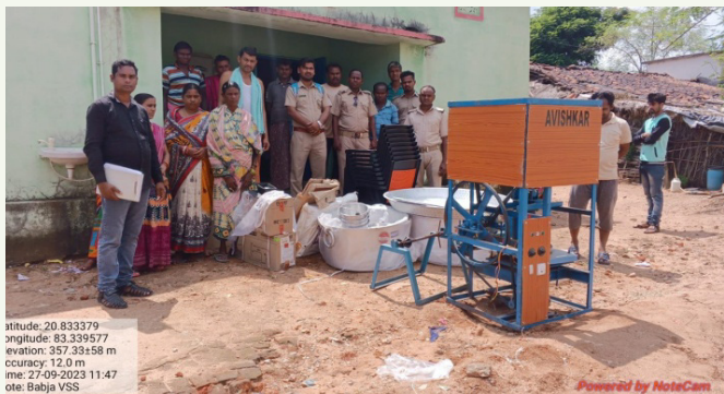
Support for livelihood promotion at Baabaj VSS, Bolangir Division