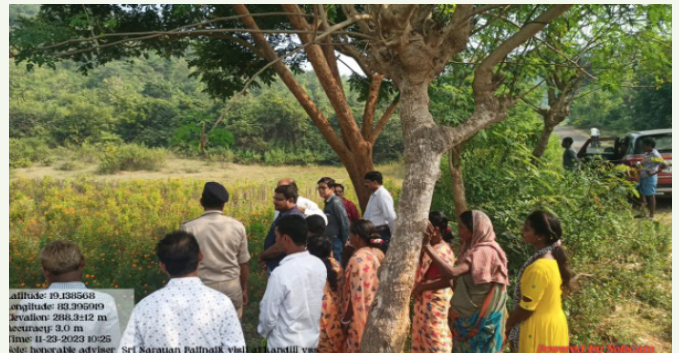
Advisor, AJY Visits IGA interventions (marigold cultivation) at Kandili VSS of Rayagada Division and interacts with the beneficiaries