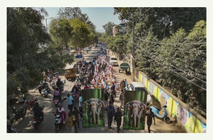
Public Awareness Rally at Keonjhar Division

Various innovative approaches and initiatives have been taken up for creating awareness among the general public, school and college students for forest protection and regeneration of forests and ecology. Some of them are highlighted below in pictorial form.