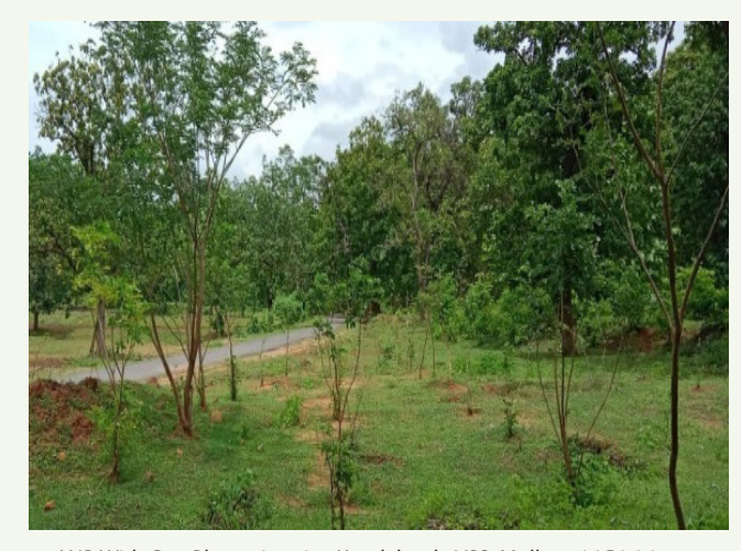
ANR With Gap Plantation site, Kondelguda VSS, Malkangiri Division