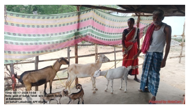
Goat rearing support to landless households