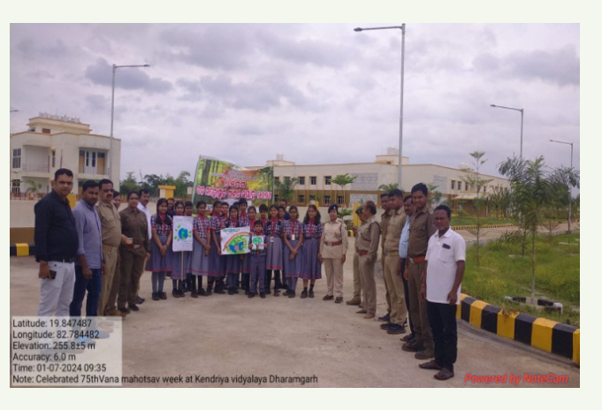
Awareness programme at Schools, Kendriya Vidyalaya, Dharmagarh under Kalahandi South Forest Division