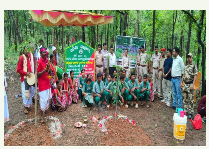
Awareness camp by School Children at Nuagaon VSS, Rourkela Division