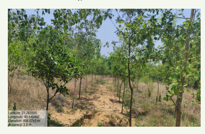
ANR With Gap Plantation site, Handibhanga VSS, Keonjhar Division