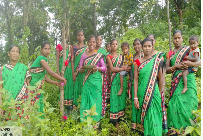
Awareness building through Raksha Bandhan at Gupteswar VSS, Jeypore Division