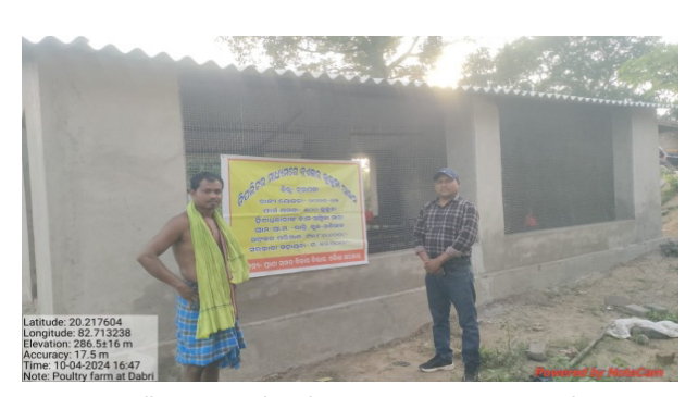
Small commercial Poultry unit support to VSS members

The impact of the initiative is clearly visible from the socio-economic empowerment of the VSS members. Almost all the households are now been able to earn an average additional income of about 12-15 thousand rupees which adds value to their dignified living. Each family is now able to meet their household needs and lead their life with dignity.