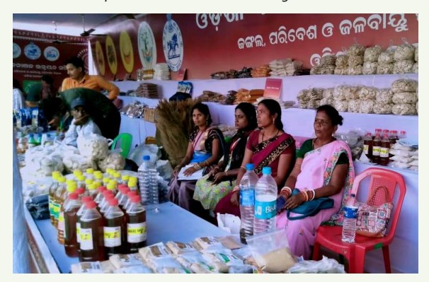
Inside view of the OFSDS Stall at 17th Kalinga Herbal Fair