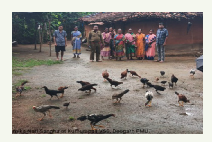
Back yard poultry farming support to the members of Tulasi SHG at Kumurapalli VSS, Deogarh Division