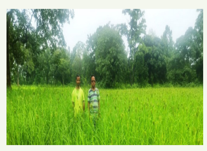
Millet Cultivation at Akhupal VSS, Keonjhar(WL) Division