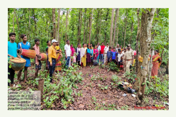
ANR without gap plantation site, Nuhamalia VSS, Keonjhar(WL) Division