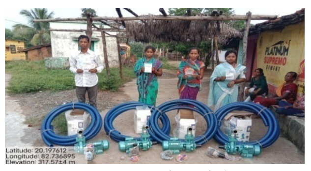
Water pump set support to farmers of Dabri VSS