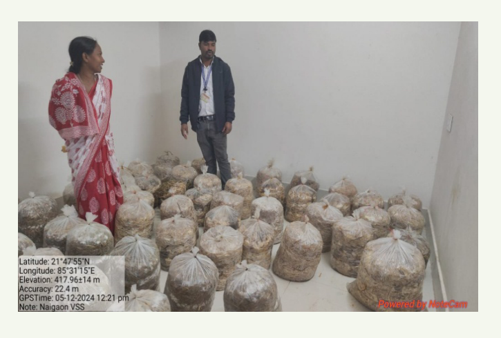
Mushroom cultivation support to the members of Naigaon VSS, Keonjhar Division