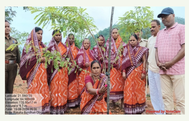
Awareness building through Raksha Bandhan at Mardanga VSS, Deogarh Division