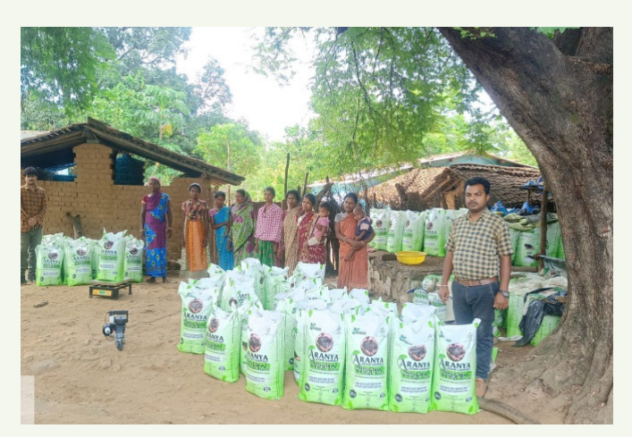
\textit{Vermi-compost production and packaging at Rion and Pratappur VSS under Rourkela\ Division}