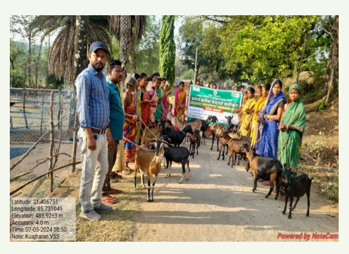
Goatary support to SHG members at Khajurijharan VSS, Keonjhar