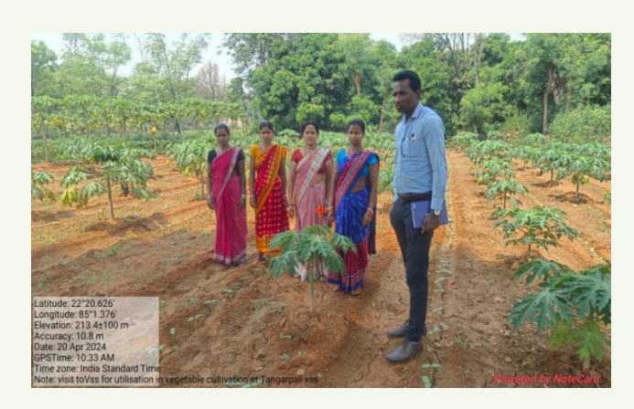
Papaya and marigold cultivation support to the SHG members of Tangarapalli VSS under Rourkela Division