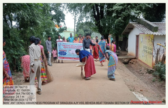
Dengue awareness campaign by the VSS members at Siriguda VSS, Nabarangpur Division