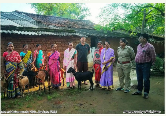
Goatary support to VSS members at Makarmunda VSS, Deogarh Division