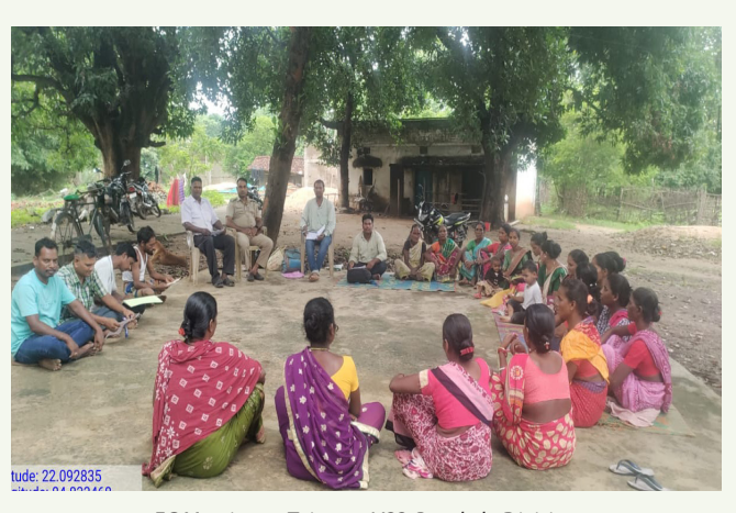
EC Meeting at Tainsara VSS, Rourkela Division