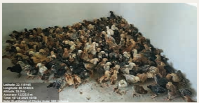
Poultry farming activity in Suliasahi VSS