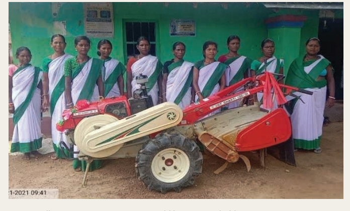
Power Tiller to Lete Gosayana SHG at Haldiboni VSS, Bahalda, Rairangpur. Convergence with ITDA, Rairangpur