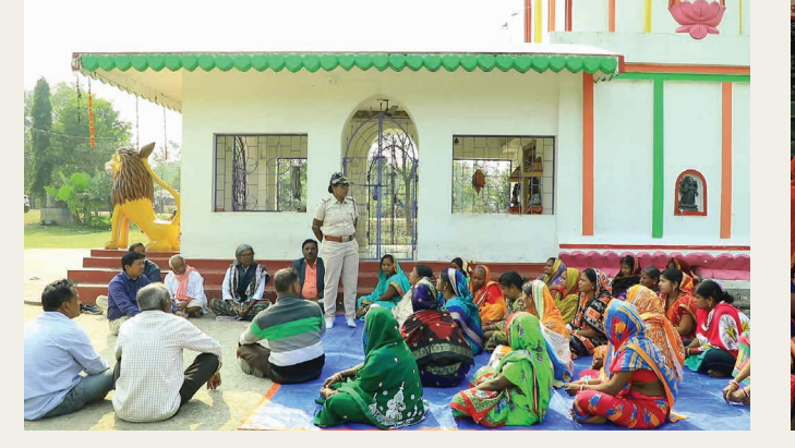
Training on RF Guidleine in Itamundia VSS, Baripada DMU