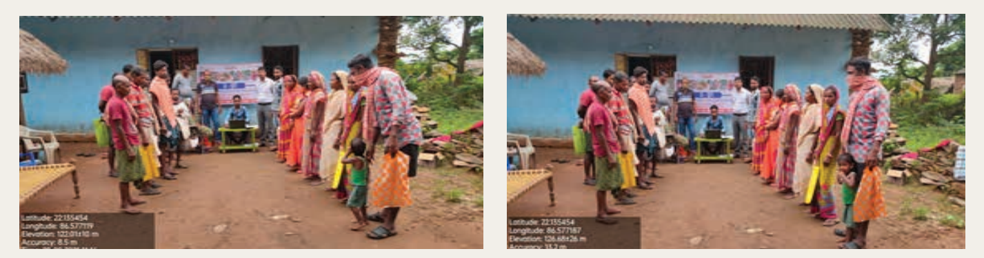
Community members enrolled under e-SHRAM Programe