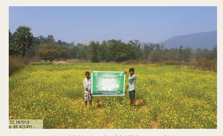
Mustard Cultivation at Pundida VSS, Rairangpur DMU