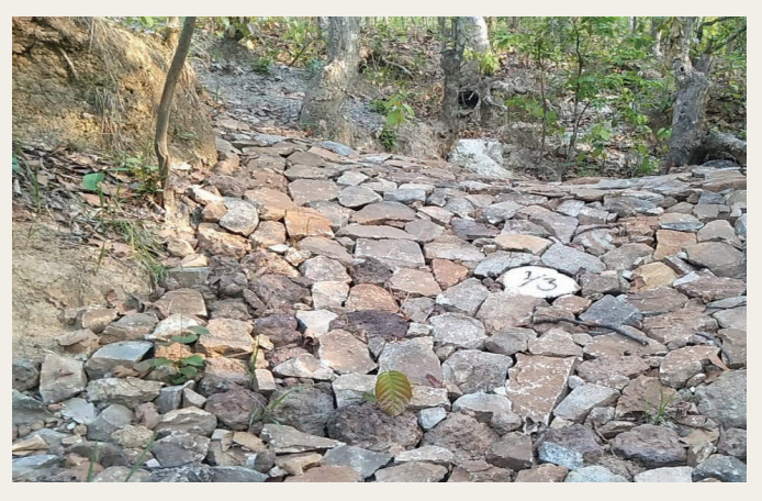
Non JFM DLT at Rengalbeda VSS, Karanjia DMU