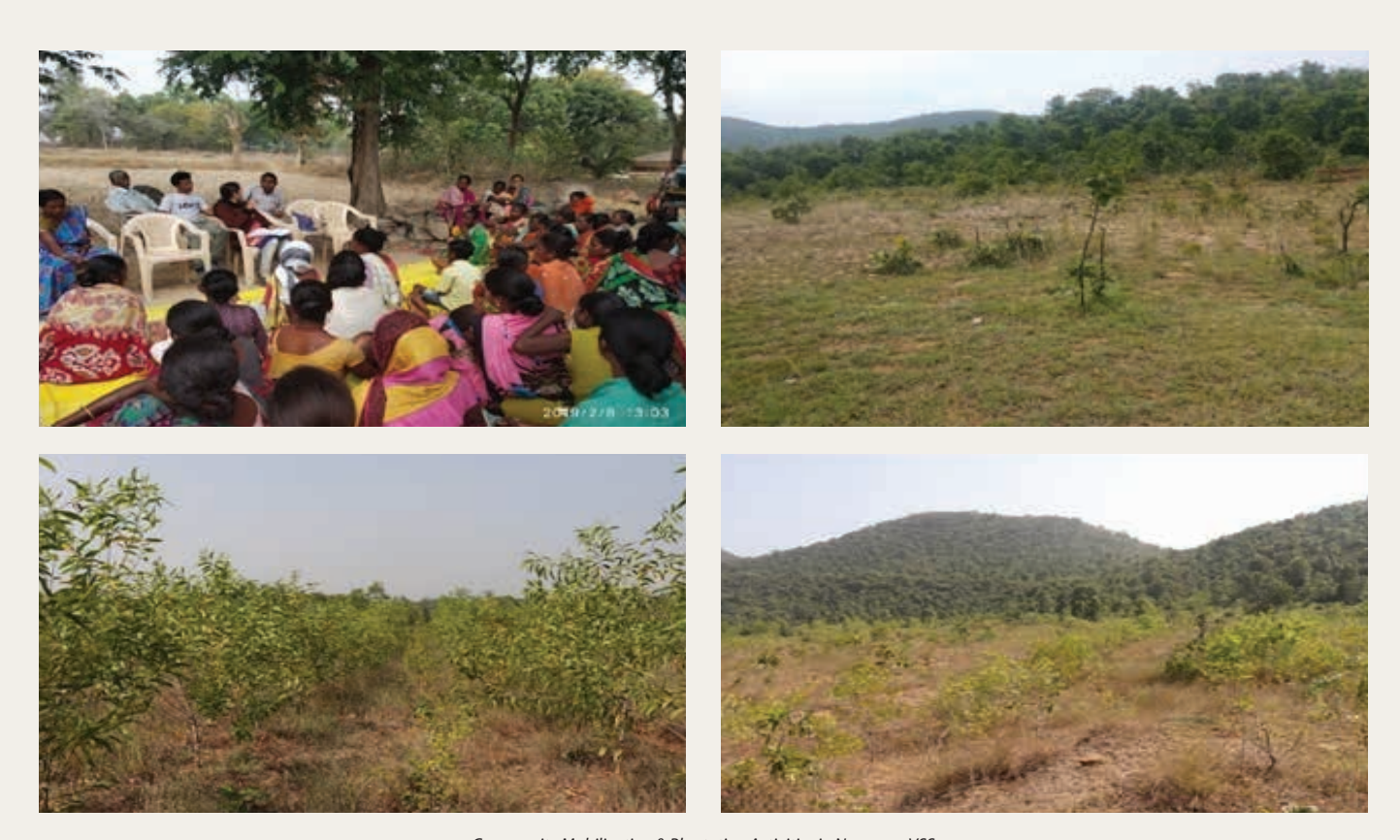
Community Mobilization & Plantation Activities in Naranpur VSS

which covered barren hillocks which was converted into a green landscape. Since the hillocks also serve as the grazing grounds for the village cattle, now it fulfils the fodder requirement of VSS community. As per the demand of local community, fodder species were planted in some parts of the hillocks. The usufruct yielding trees were planted on the foot hills to ensure benefits to the local community. The forest / tree cover in those hillocks also help to enhance carbon sequestration in addition to meeting the villagers' requirement for fuel, fodder, timber & NTFPs. In total 337 man days were created for the plantation works undertaken in the VSS.