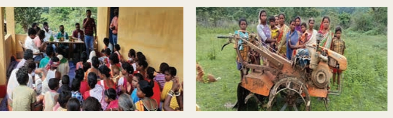
Members of the Maa Ambika SHG with the Power Tiller

Maa Ambika SHG requested to get a power tiller with that money and seeking the help from the FMU team to arrange another Rs.1 lakh loan to purchase the power tiller. After exploring the loan possibilities in different banks, they were successful to get one lakh loan from the Odisha Gramya Bank, Sargoda. After the loan amount got credited to the SHG account, the FMU team helped the SHG to purchase the Power tiller from the dealer. During the cultivation season of 2021-22 Maa Ambika SHG earned Rs. 50,000/- by lending the power tiller on rental basis to the farmers who wanted to use it in their field for cultivation. The SHG members started repaying the loan in installments to the bank from this earning. They are also planning to increase their earning so as to support their livelihood. Their hope for changing their socio-economic status by putting the power tiller in proper use will be realized soon.