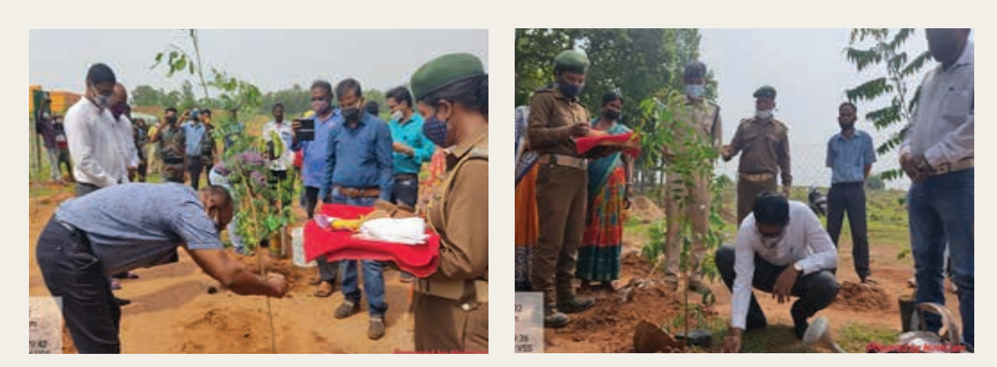
Plantation Drive undertaken in Karanjia Forest Division

At the end, the DMU Chief, Tahasildar, Fire Officer as well as the VSS President appealed and administered an oath to the VSS members to protect the forest and increase the forest cover to save the environment for the interest of the health of earth.