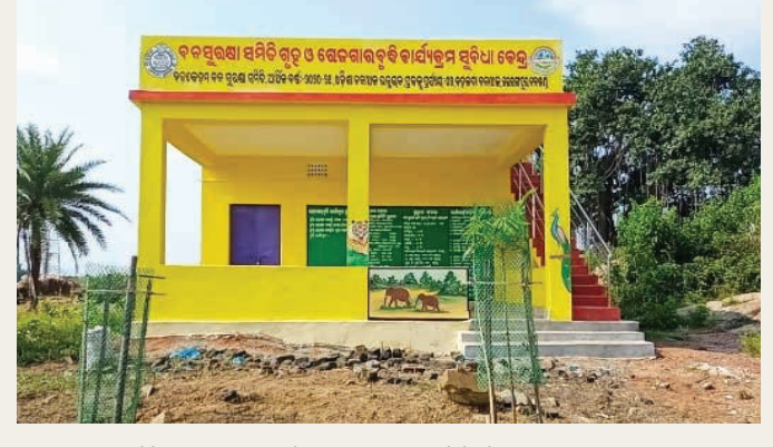
VSS Building cum IGA Facilitation Center, Badakedum VSS, Rairangpur DMU

Please send your comments and inputs to: