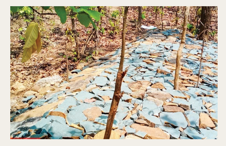
DLT Works in JFM at Purunapani VSS, Karanjia DMU