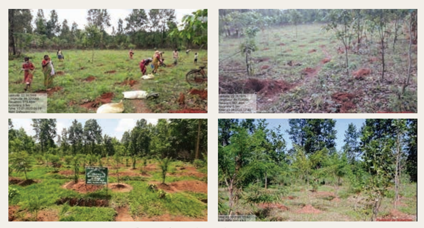
Different stages of ANR-200 taken up at Dahupani VSS in Jari Reserve Forest

The VSS is adopting Thengapali system to protect Jari RF as well as new plantation carried out under ANR. Due to the stringent protection measures adopted by the VSS, the wild animal population viz. wild pig, barking deer, Indian hare etc. are increasing gradually. Due to increase in browsable layer a few spotted deer are now found in the VSS area. Besides, the forest area protected by Dahupani VSS is regenerating well.