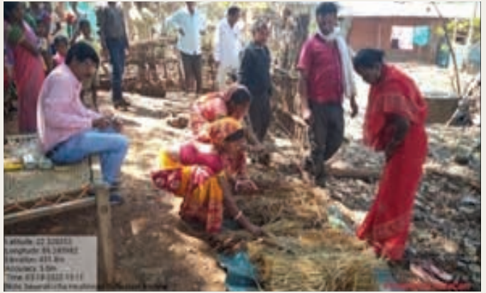
Practical Demonstration to SHG members by OFSDP-II functionaries