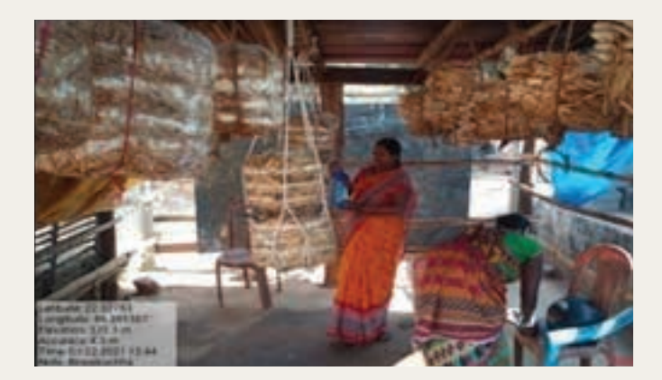
Oyster Mushroom beds ready for plucking