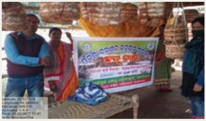
Monitoring and hand holding support by Horticulture Department & DDH, Rairangpur