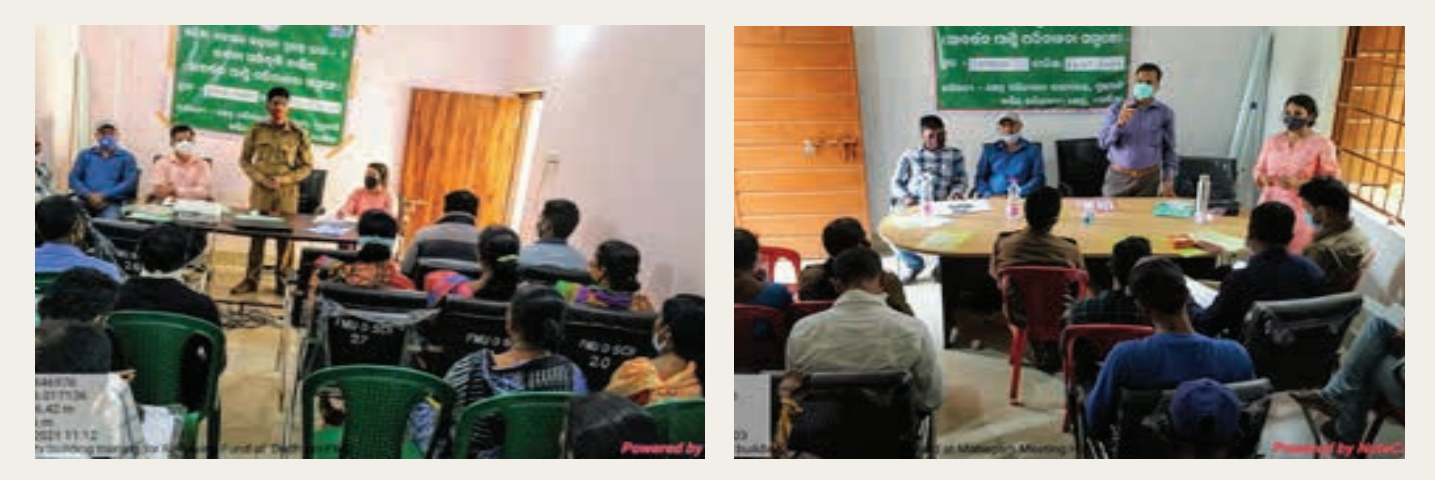
Traning programme on Revolving fund at Dudhiani FMU