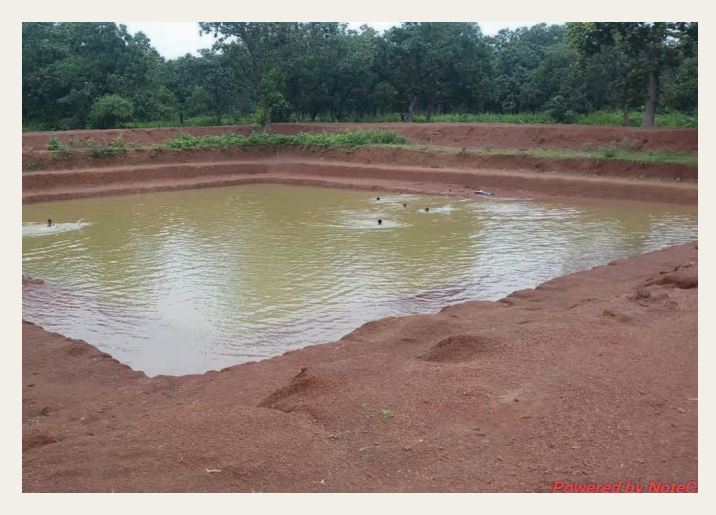
ROWHS at Daladali VSS in Betanati Range of Baripada DMU