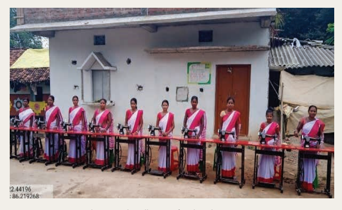
Sewing Machine to Baba Tilla SHG of Kudarsahi VSS, Rairangpur DMU