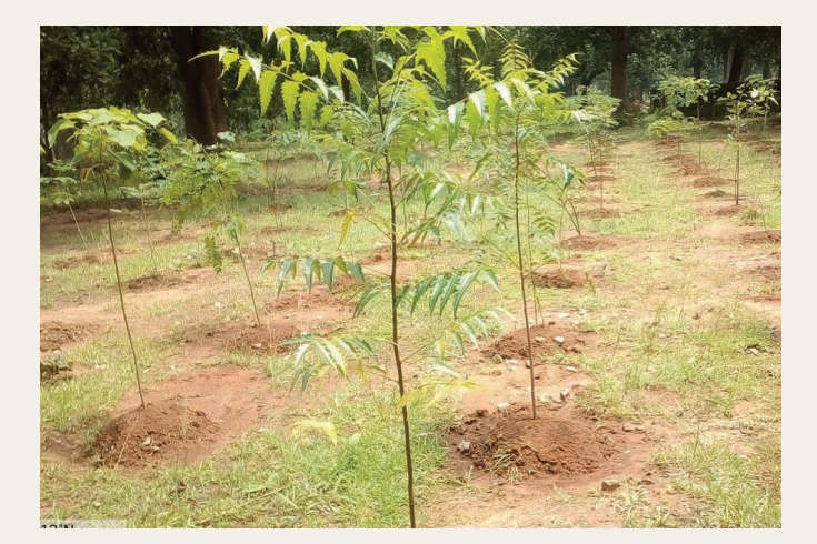
Plantation of Fuel Fodder at Danuabaliposi VSS, Karanjia DMU