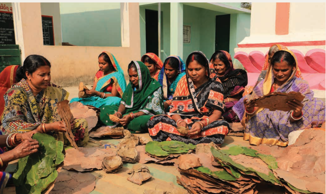
Sal leaf stiticting by community members in Itamundia VSS, Baripada DMU