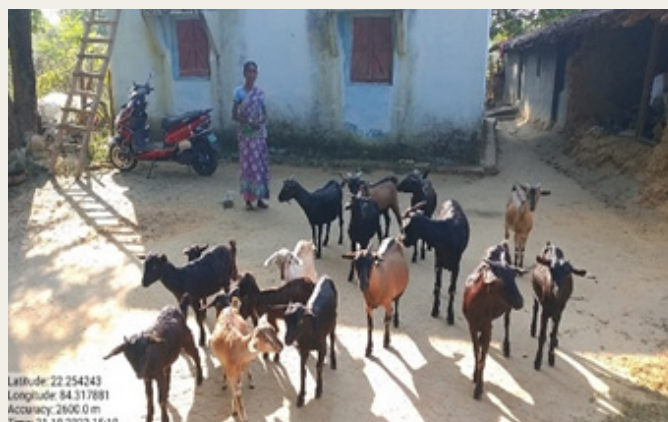
Goatery farming by Shanti SHG

Under the project initiatives, participation of women members and vulnerable groups in different income generating activities has been ensured and enhanced. Various capacity building programmes were conducted at VSS, FMU and DMU level under OFSDP-II where the VSS members as well as the SHG members from the village have participated. With support from the Revolving Fund, income Generation Activities like goatary and piggery farming have been taken up by two SHGs from the village. 20 kgs of mustard seeds was distributed to 20 nos of beneficiaries, vaccination camp for small and large ruminants was organized, distribution of battery powered sprayer for agricultural purposes, distribution of vegetable minikits etc. were provided through convergence to enhance the livelihoods of the VSS members.