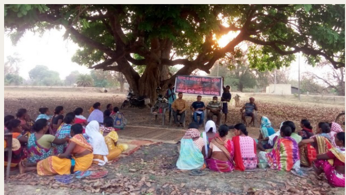
General Body Meeting

of the VSS and their role is very crucial in protection of the forest. The villagers, are very united in forest protection and strictly following Thengapali with involvement of all villagers for forest protection. They organize meetings and create awareness among the nearby villagers through awareness camps for forest protection. The VSS members have effectively created fire line along the Forest area and because of the continuous efforts of the VSS, no forest fire has been detected in the VSS area during last 8 years. There has been an increase in the forest growth which is clearly evident.