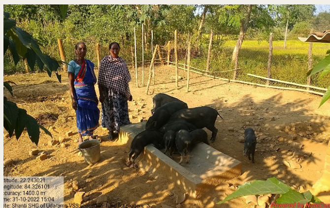
Piggery farming by Shanti SHG