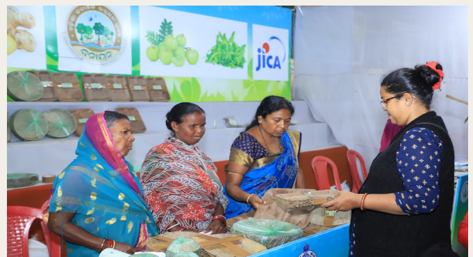
Tribal women selling their products in Adi Bazar

After the completion of Mela, the SHG members shared their experience with other members of the VSS. They were very happy with their new experience. They had a good stay and nice business activities due to all the support from PMU and OFSDP-II. The SHG and its members are now excited to participate in any mela or exhibition in the coming days.