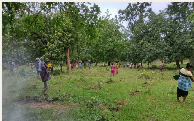
VSS members in plantation work