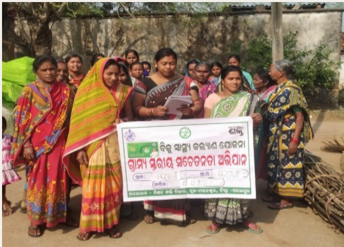
BSKY enrolment of beneficiaries in Sambalpur Division

As OFSDP-II has also been emphasizing inclusive sustainable development of forest fringe communities through convergence of various schemes of line department, the project staff of all four Ranges intensively sensitized the community members and enrolled 10176 house hold out of 10485 eligible house hold of VSSs and make the scheme success. The FMU wise HHs covered under the scheme is as follows: