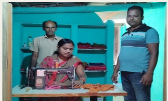
Livelihood through tailoring with RF assistance