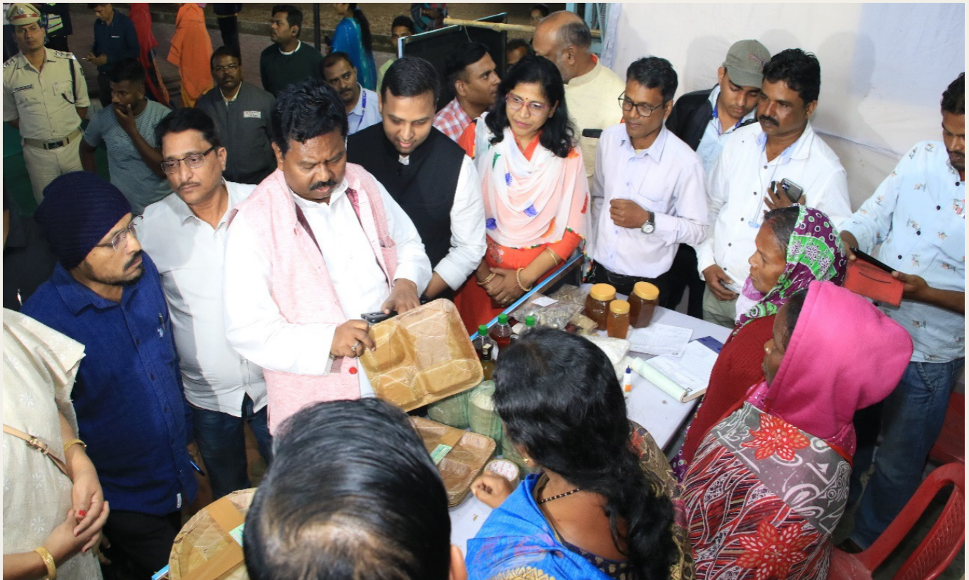
Glimpses from the inaugural session of the OFSDS Stall at Aadi Bazar Fair by TRIFED 2022