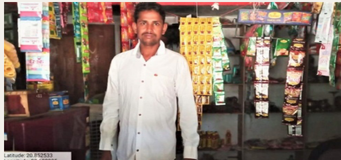
Grocery shop activity with RF assistance