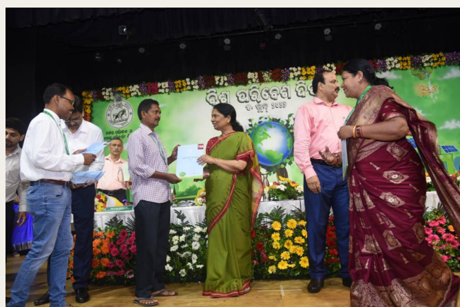
Udarama VSS receiving Prakruti Mitra Award

Under the project initiatives, participation of women members and vulnerable groups in different income generating activities has been ensured and enhanced. Various capacity building programmes were conducted at VSS, FMU and DMU level under OFSDP-II where the VSS members as well as the SHG members from the village have participated. With support from the Revolving Fund, income Generation Activities like goatary and piggery farming have been taken up by two SHGs from the village. 20 kgs of mustard seeds was distributed to 20 nos of beneficiaries, vaccination camp for small and large ruminants was organized, distribution of battery powered sprayer for agricultural purposes, distribution of vegetable minikits etc. were provided through convergence to enhance the livelihoods of the VSS members.