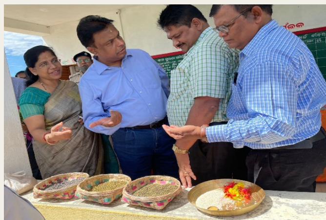
Field visit of PMU and MMSA team for initiating additional IGA activities through Social and Business enablers in Ghumsur North Division

Please send your comments and inputs to: