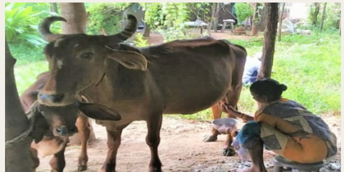
Dairy farming by beneficiary in Subarnapur Division with RF assistance