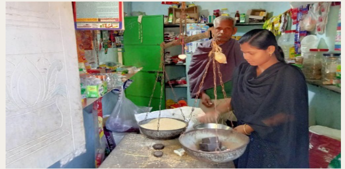
Livelihood through grocery shop by female VSS member with RF assistance