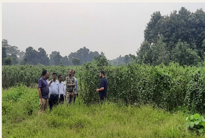
Field visit of PMU and MMSA team for initiating additional IGA activities through Social and Business enablers in Sundergarh Division