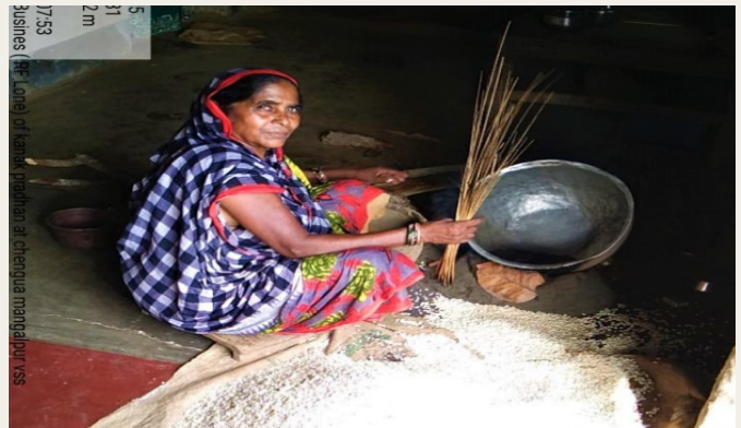
Beneficiary making her life from Puffed Rice business