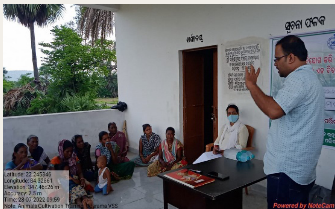
Capacity building training for Goatary and piggery farming

ANR with gap plantation over 45 ha. along with SMC / DLT works, fire line creation etc. have been implemented in the VSS area for sustainable forest management. Now every day a group of 2-3 person patrols the forest on a rotational basis to guard the forest against forest fires, illegal thefts. Hence, the forest area protected by Udarama VSS is adequately regenerating.