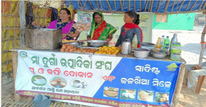
SHGs making business out of Revolving Fund in Ghumsur (South) Division

Rs.100,000/- (@Rs. 50,000/ to each SHG) was sanctioned by the VSS for the above IGA. Earning from both the outlets from the products and tiffin selling is estimated to be approximately Rs. 2500 to Rs. 3000/-per day with an approximate profit of about Rs. 1000-1200/- per day. Out of the profit both the SHGs are repaying the loan amount regularly to the VSS. Based on the current business response, it is expected that this Centre would be the prominent and primary pulses cluster point of Ghumsur South Division in future.