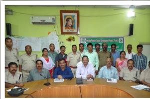
Training at Sambalpur