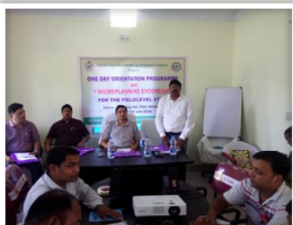
Training at Athamallick