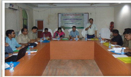
Training at Boudh