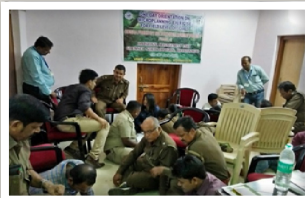
Training at Jharsuguda