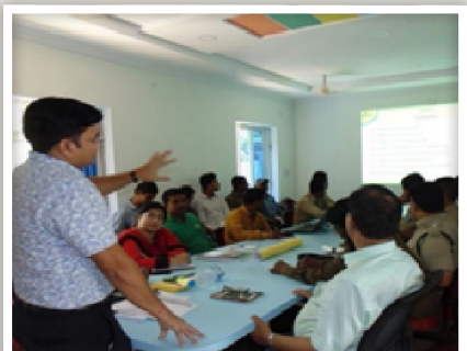
Training at Boudh