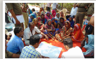
Training at Ghumusar North