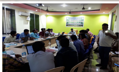
Training at Ghumsur North