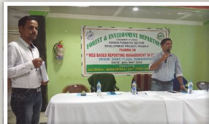
Training at Rairangpur