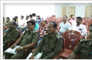
Training at Karanjia