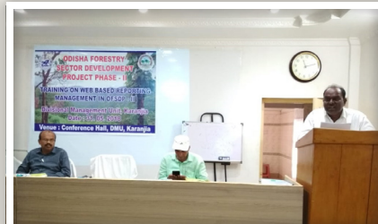
Training at Karanjia