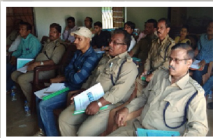
Training at Ghumusar South