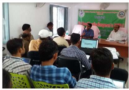
Training at Sambalpur