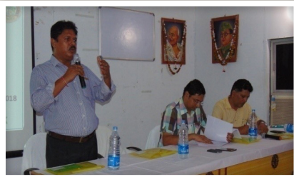
Training at Athamallik