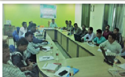
Training at Ghumsur South