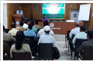
Training at Rairangpur