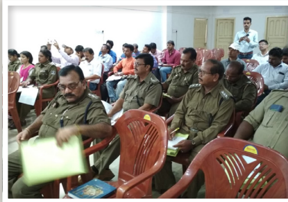
Training at Subarnapur