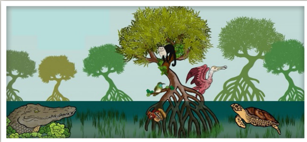
NCSCM Meeting Theme