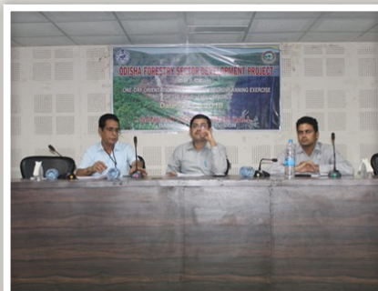
Training at Baripada