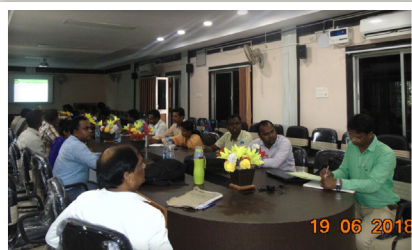
Training at Dhenkanal