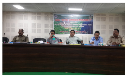
Training at Baripada