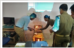
Training at Karanjia