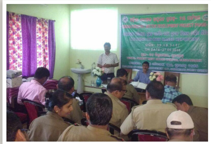
Training at Sundergarh