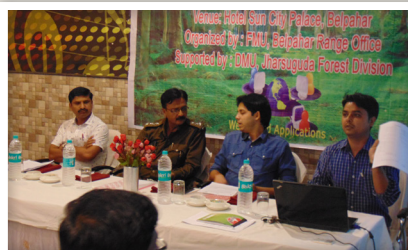
Training at Jharsuguda