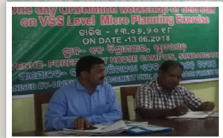
Training at Subarnapur