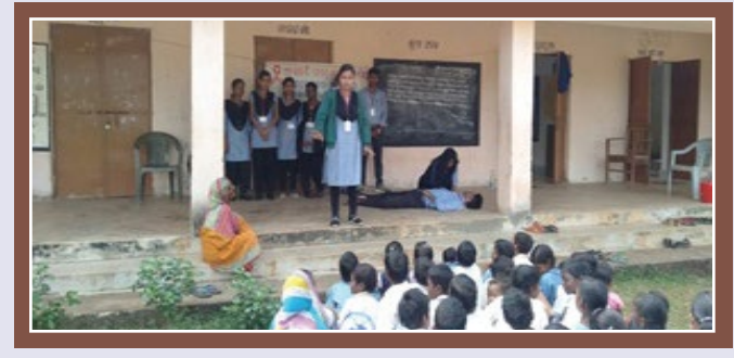
Play on Awareness of AIDS

An awareness campaign has been organized at Kusupada VSS of Dhenkanal FMU under Dhenkanal Management Unit, Dhenkanal Forest Division on the eve of WORLD AIDS DAY on 1st Dec 2018 by the coordination of PNGO NYSASDR, Dhenkanal.