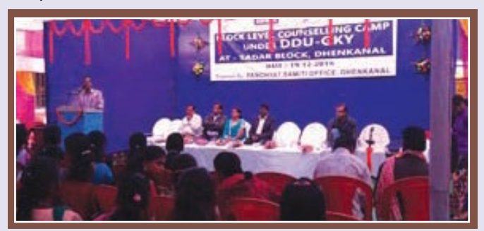
Counselling Camp of DDU-GKY at Dhenkanal

The youths, both male and female in the age group of 18 to 35 years from different parts of the Dhenkanal and Odapada Block attended the DDU-GKY camp. On behalf of OFSDP, through FMU, Dhenkanal 170 youths participated in this camp. These youths were identified by Animators of 14 VSSs of 1st Batch having educational qualification ranging from Class – V to +3 standards. DMU,FMU and VSSs have taken different roles for identification and sending the candidates to the counseling centre. Finally, 85 candidates from 9 VSSs were selected in the camp under different trades.