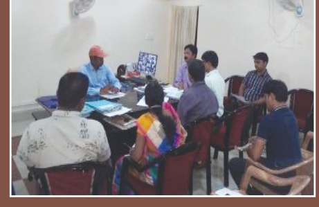
BLAC meeting at Lakhanpur Block