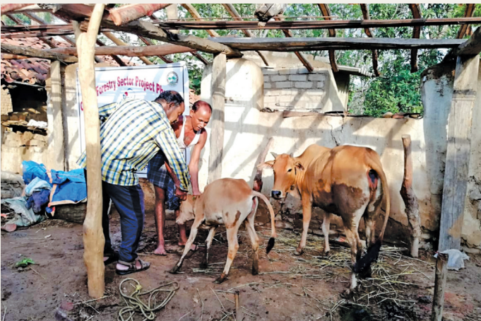
Vacination Camp for Livestock under Jharsuguda DMU