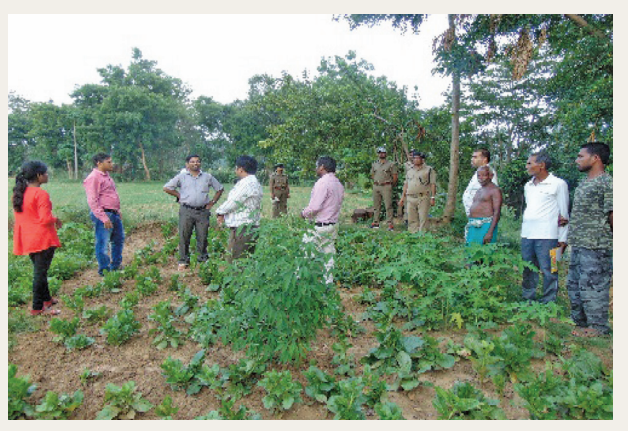
Scientists of ICAR, Bhubaneswar & KVK, Jashipur and DFO-cum-DMU Chief& staffs are visiting the vegetable field & interacting with farmers at Check Dam-01.