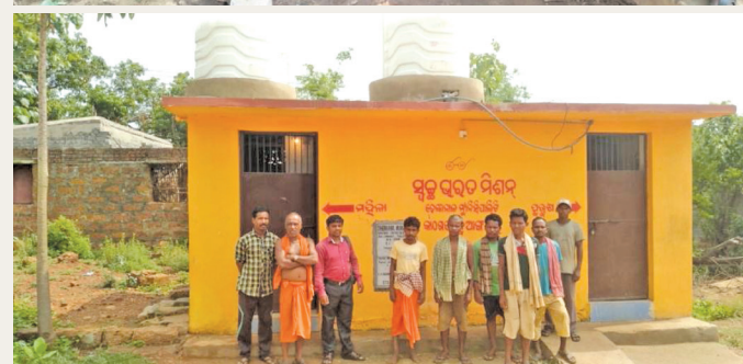
Community Mobilisation at Kathagada Ragadi Sahi VSS.

by submitting the application. After 2 days the J.E visited the spot and sent a technician to repair it and the bore well worked like previously.