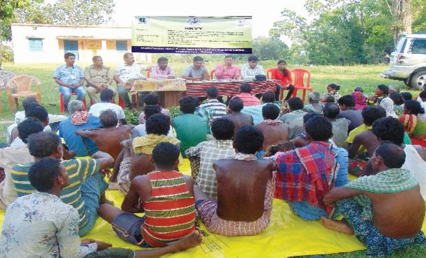
Implementation of convergence programme of RKVY under Rairangpur DMU.