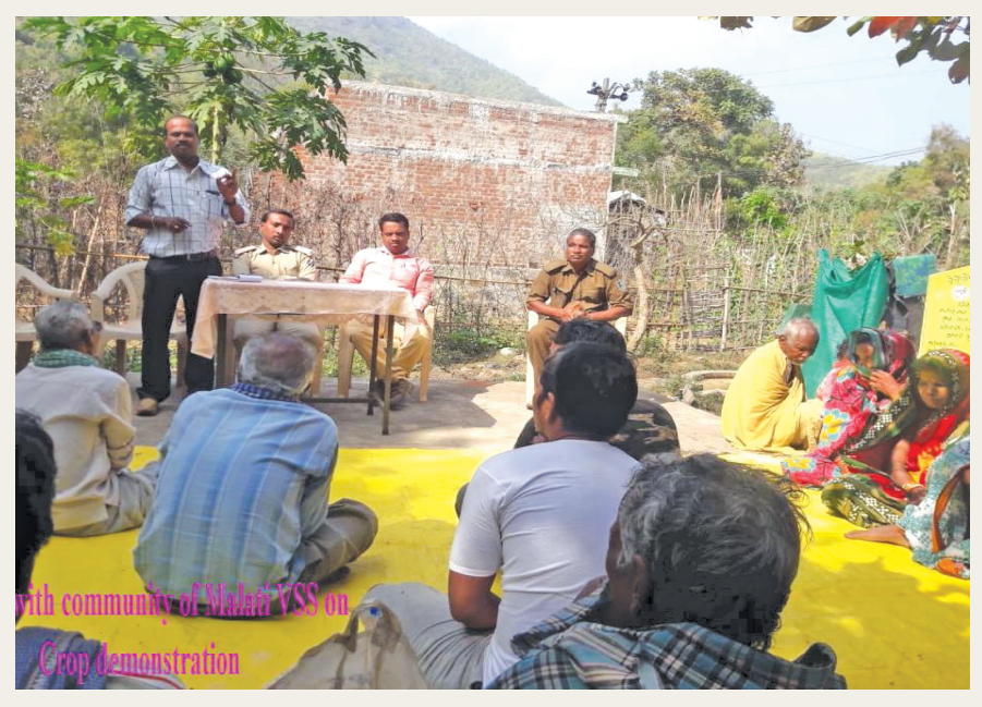
Community mobilisation work at Malati village under Ghumusur (North) Division

Every Person desires to live a dignified life in the present era. This is both for the people living in the cities and also in rural areas. All people want that their style of living may be upgraded with mainstreaming in present situation. Malati is a village inhabited by the tribal people. This village is coming under the Aska Block of Ganjam District & Ghumsur North Forest Division, Malati village is a very interior village, looked down by neighbouring villagers due to lack of modern living style. All the communities in this village depend on forest and forest produces. They are mitigating their bread and butter from the forest by collecting the sal leaf & other NTFPS. People of Malati village have not singleness of purpose for