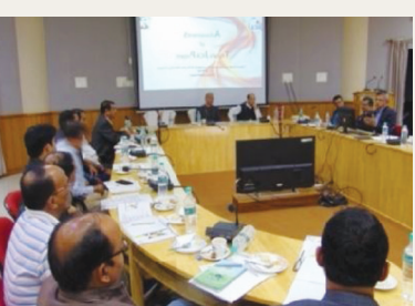
Exposure visit of PMU delegates to Tripura