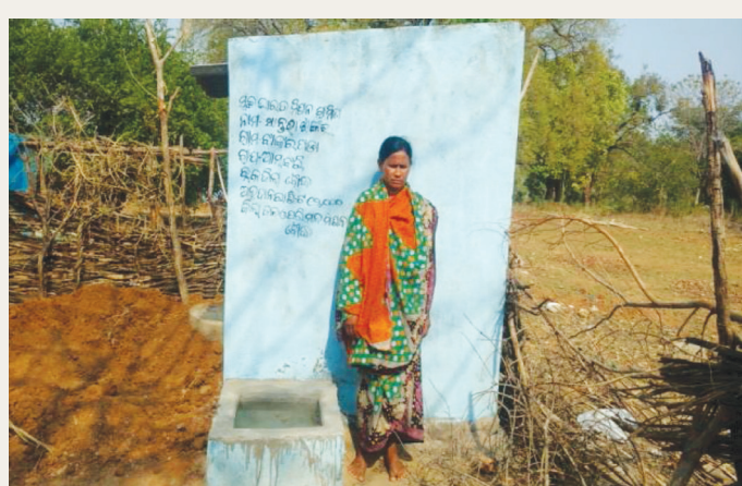
Success of Swachha Bharat Mission - Gramin Programme in Boudh DMU