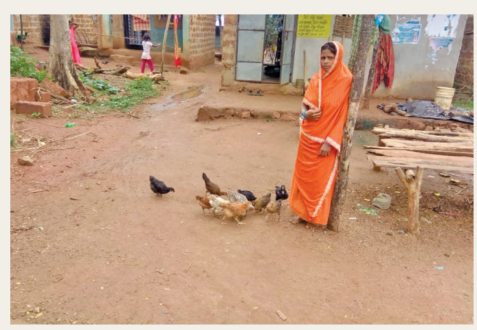
Livelihood Support Programme of Poultry Farming in VSSs of Ghumsur (South) Division.