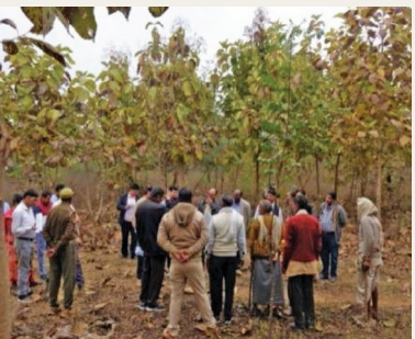
Exposure visit of PMU delegates to Uttar Pradesh