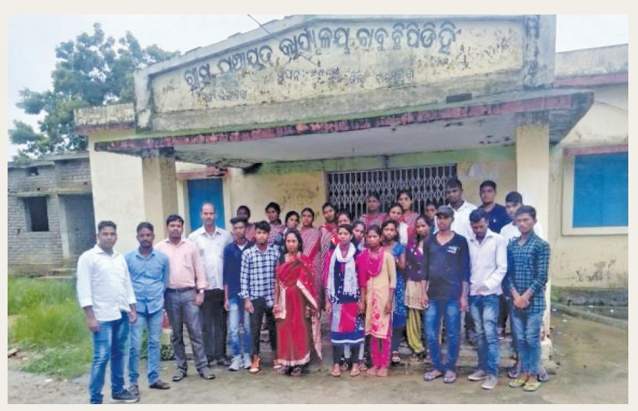
VSS members of Malati village

villagers, who were taking stock of the Malati village, are surprised to see the good crop and greenery in waste lands of the village. Now they are whispering to each other how the people of the street of Malati village have developed and they also want handholding support from the Malati. As best practices and model of agriculture farming, the people of the street: Malati, have been recognised.