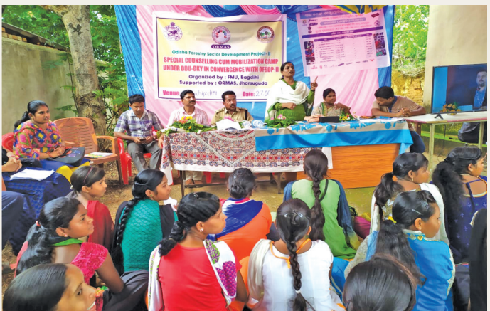
Mobillisation \ Camp\ under\ DDU\text{-}GKY\ in\ convergence\ with\ ORMAS\ and\ Jharsuguda\ DMU