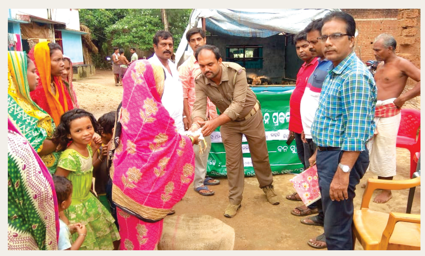
Distribution of Gouraja Poultry Chicks by forest officials to VSS members of Ghumusur (South) Division

utilise small amount from their savings towards this small IGA. The 28 days Giriraja poultry Chiks were supplied to the SHG members at a cost of Rs 60 per chick. The beneficiaries are happy with the support and they have prepared the indigenous shed by their own without getting any financial support from the Project. The mortality rate of the chicks is very less as 28 day old