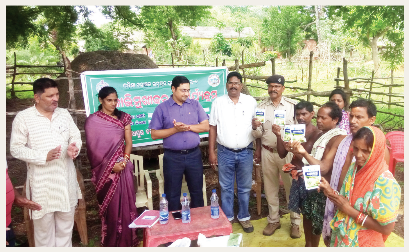
Cropping system based demonstration programme (CSBD) under Athamalik DMU.

Techniques for seed treatment & carbendazim sachets had been