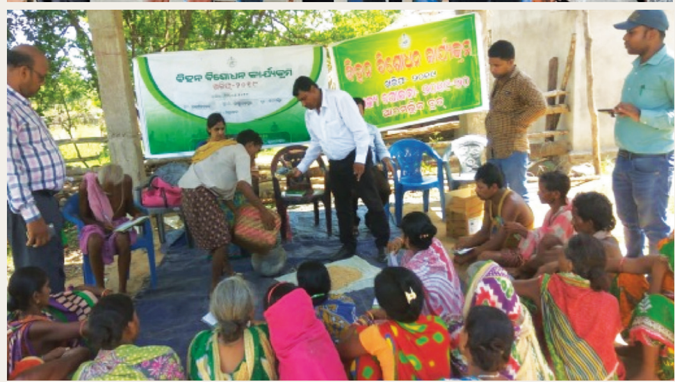
OFSDP-II faciliatates CSBD Programme in VSSs of Athamalik DMU