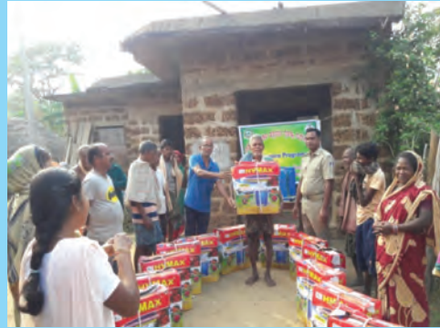
Orientation of community members for livelihood programme

The Patalu VOSS in Hindol FMU under Dhenkanal Division actively participated in implementing convergence activities and mobilizing fund from other sources. Through OFSDP-II and in support of Agriculture Dept 13 nos of sprayer machines were distributed among the VSS members. During Rabi season, Green gram, Back Gram, Sunflower seeds, Grounds nuts were distributed for cultivation over 22 acers land and fund of Rs61,000/- mobilized for the purpose. Convergence activities are having its positive impact and it shows the effective way of creating a mile stone of development process.