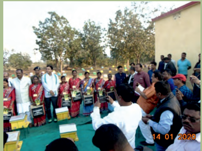
Training on Bee Keeping under OFSDP-II in Dhenkanal DMU