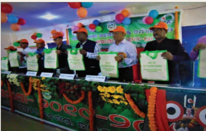
Ghumsur South DMU