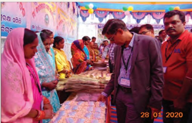
Ghumsur North DMU