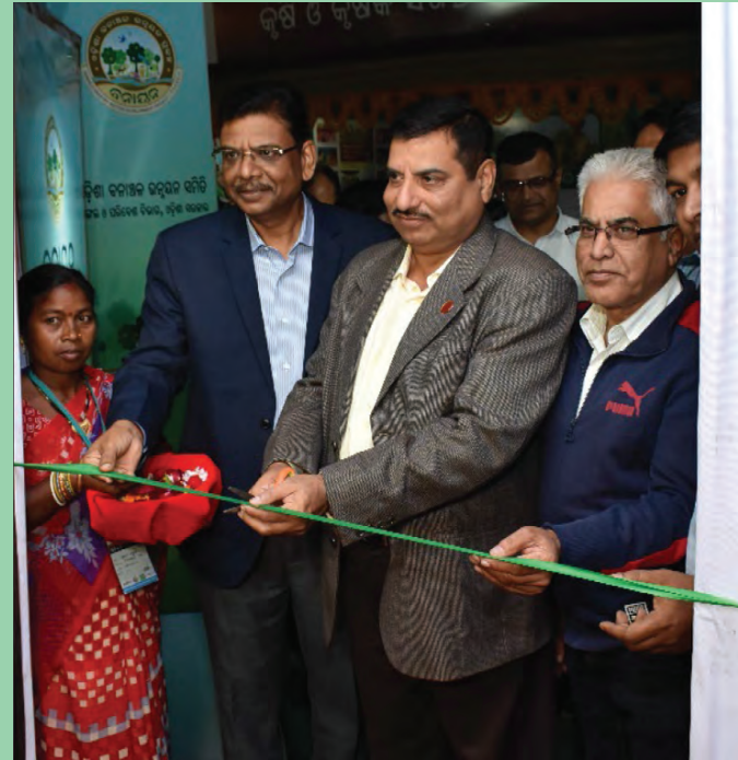
PCCF & PD inaugurating OFSDS stall in Adivasi Mela 2020

This was the second time in OFSDP, Phase-II project that community beneficiaries took part in the State level