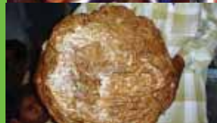
Mushrooms production as an IGA