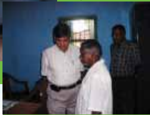
Project officials in the field appraisal