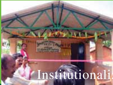
Dimirimunda VSS Building