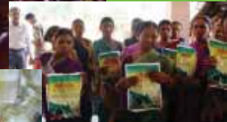
Seeds for vegetables