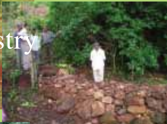
Nursery protection from elephants