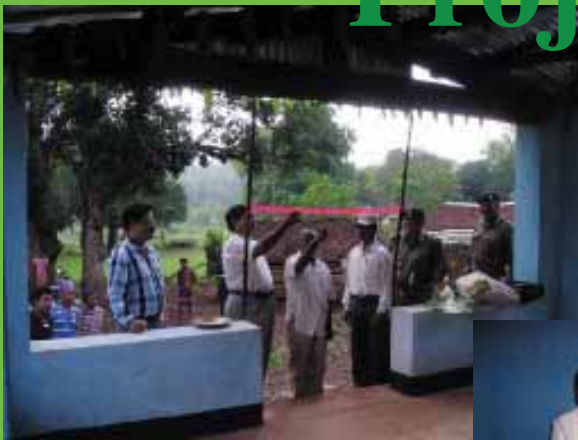
Inauguration of Meeting Hall Bayapanadhar VSS by the president of VSS in the presence of Project Director.