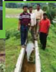
Lift Irrigation facility