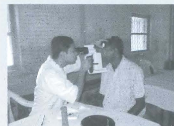
Eye screening of the Drivers at the camp site.

ness, 27 were diagnosed with refractive error and were prescribed glasses and a further 79 were given prescription medications. This program was highly successful and will help to keep safer roads in the near future.