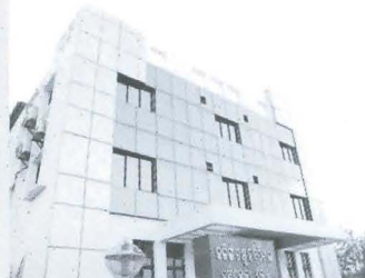
Kalinga Eye Hospital at Dhenkanal, Odisha

Since its inception in 2002, KEH has been providing free, high quality eye care services to poor and underserved citizens of Odisha. As a result of our efforts, thousands of poor and marginalized people receive eye care and many regain the ability to see. By providing