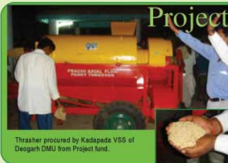
Thrasher procured by Kadapada VSS of Deogarh DMU from Project fund.

Environment friendly entrepreneurial skills being used in the Saguna Baug for managing tourist places and innovative integration of different income generating activities like Dairy farming, Tourist Cottages, pisciculture and gardens. Man-Animal conflict resolution in the densely populated peripheral areas of Sanjay Gandhi National Park; Development of Eco-guides and relevance of Bio-diversity