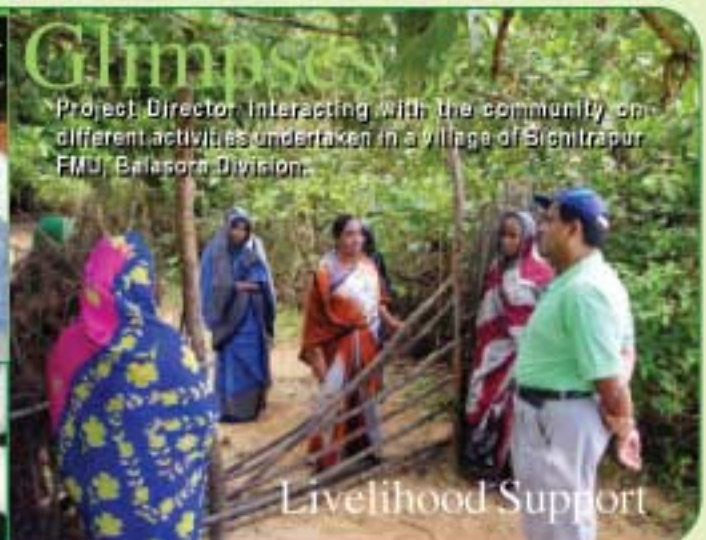
Project Director interacting with the community on different activities undertaken in a village of Sighitrapur FMU, Balasora Division.