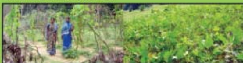
a letter by SHG beneficiary

Many SHGs have received assistance through VSS revolving funds for undertaking micro-enterprise activities under the project. Such SHGs are reaping good dividends from the existing support system under the project and encouraging other people for starting similar activities and taking benefits from the project. Lakshmi Parbati SHG from the village Goelmara in Barkote Range got benefited through the VSS revolving fund and its president wishes to share the experience through a letter addressed to unknown friend in other SHGs/VSS under the project for availing the benefits through project support. A concise script of the letter sent by the president of Lakshmi Parbati SHG to her friend is being given here-