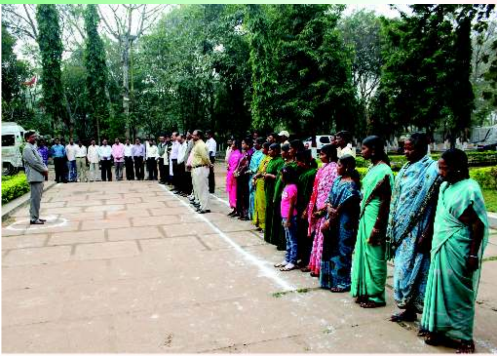
Celebration of Republic Day at PMU, OFSDP. All the staffs & SHG Member, who attended Adivasi Mela - 2012 participated in the occasion.