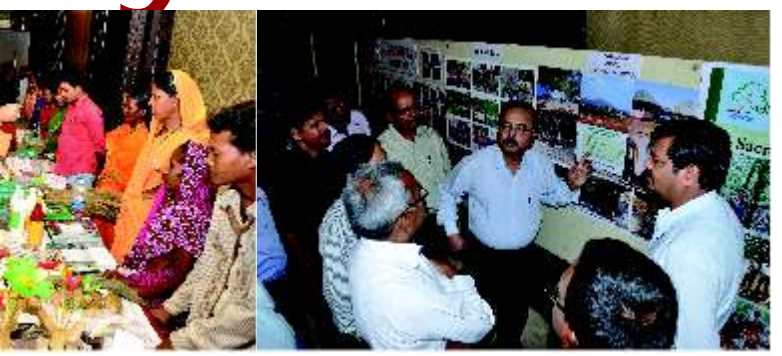
formance" were presented on this occasion. The list is provided below: