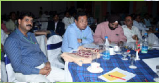
Delegates from other states