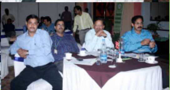
DFO-cum-DMU Chiefs, OFSDP