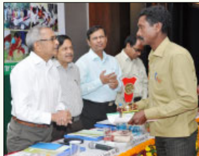
Luluburu , Balda FMU, Koraput DMU