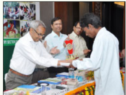
Badapada , Gupteswar FMU, Jeypore DMU