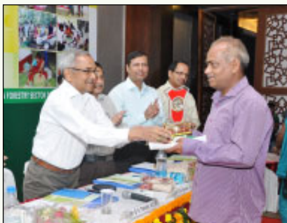
Katedikia , Raikia FMU, Phulbani DMU