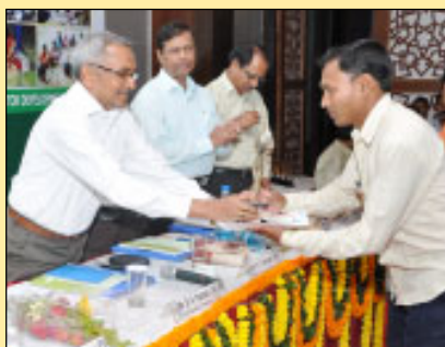
Sri Dakhina Munda Lunga VSS, Bonai DMU