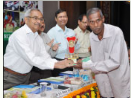
Nuadihi , Bonai FMU, Bonai DMU