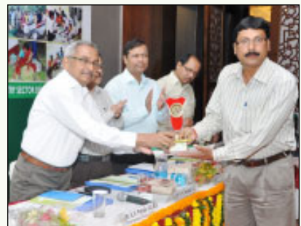
Chainpur , Kuarmunda FMU, Rourkela DMU