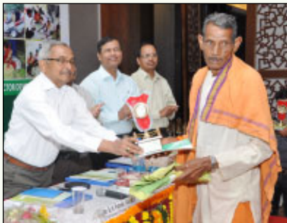
Champadihi , Keonjhar FMU, Keonjhar DMU