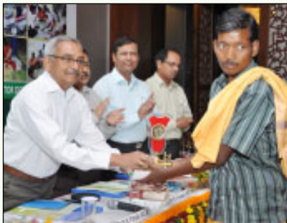
Kundari , K. Nuagaon FMU, Balliguda DMU