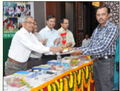
Daabada , Chandragiri FMU, Paralakhemundi DMU