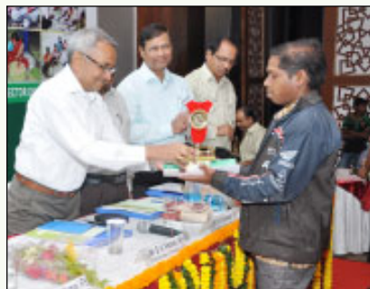
Kumango , Rayagada FMU, Rayagada DMU