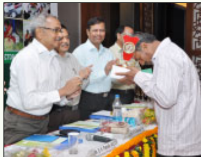
Jharjhari , Reamal FMU, Deogarh DMU