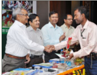
Pokatunga , Raigoda FMU, Angul DMU