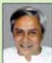
NAVEEN PATNAIK Chief Minister Orissa

Orissa Forestry Sector Development Project is a noble initiative for attaining the goals of healthy forests and prosperous community. Over exploitation of the forests for various reasons in past, has resulted in their degradation, which has created livelihood problems for forest dwellers. This project rightly aims at conserving the forests and alleviating the socio-economic status of people in forest fringe villages. Participation of rural communities in management of the forests will benefit both the forests and people in the short as well long term.