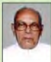
RAMESHWAR THAKUR Governor of Orissa

I am glad to know that Orissa Forestry Sector Development Project is bringing out the first issue of the Newsletter relating to its activities on quarterly basis.