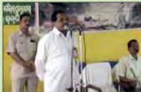
Hon'ble Minister, Steel & Mines and Planning and Co-ordination, Orissa, inaugurating one extension building in Phulbari Division.

Construction of extension buildings at DMU and FMU offices is in progress for which plans and estimates