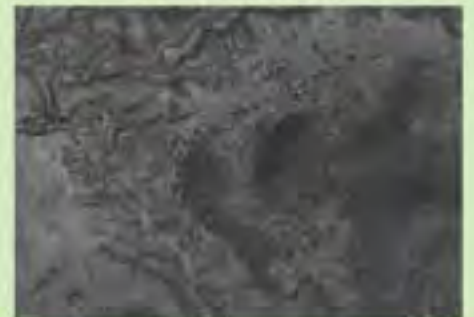
Sample Cartosat 2.5m b/w data