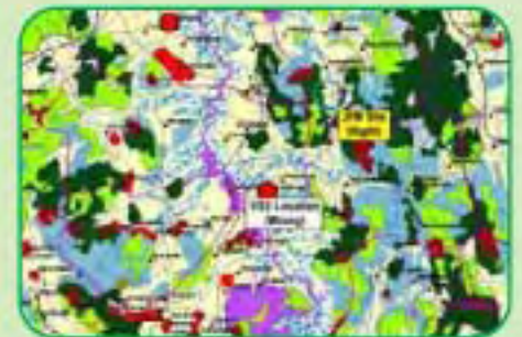
Depiction of JFM Areas on Land use Map prepared by ORSAC

The boundary surveys of the sites have also started using DGPS devices and work is in progress.